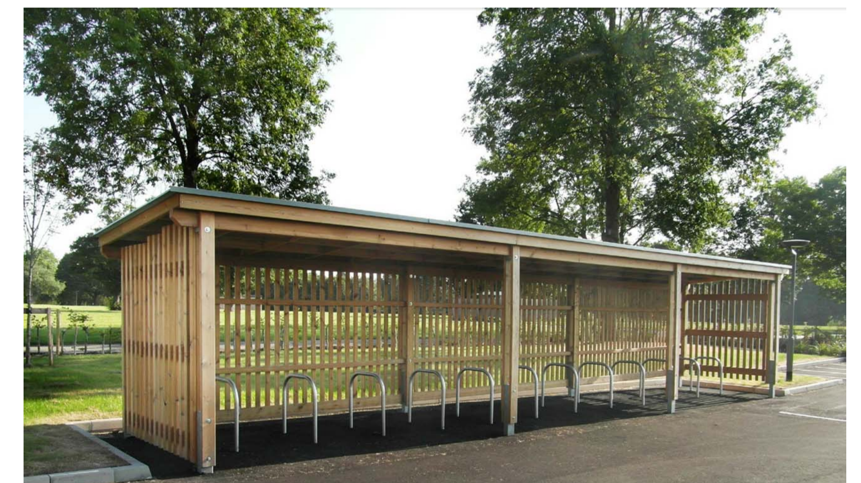
PRECEDENT IMAGE 02

PROJECT BICESTER GATEWAY CLIENT LONDON & REGIONAL DATE 14/12/2017 23:24:31 PROJECT ADDRESS BICESTER, OXFORDSHIRE DRAWING TITLE CYCLE SHELTER SHEET STATUS DESIGN DEVELOPMENT DRAWING NO. DD-BIC-NOR-XX-00-GA-A-6001 SCALE As Indicated @ ISO A1