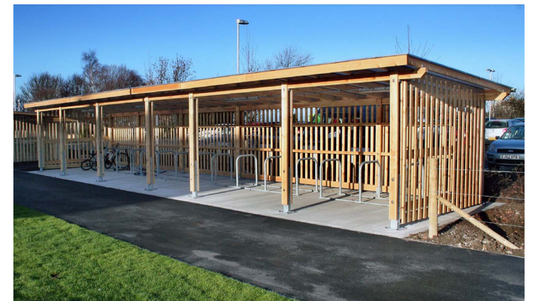
PRECEDENT IMAGE 01