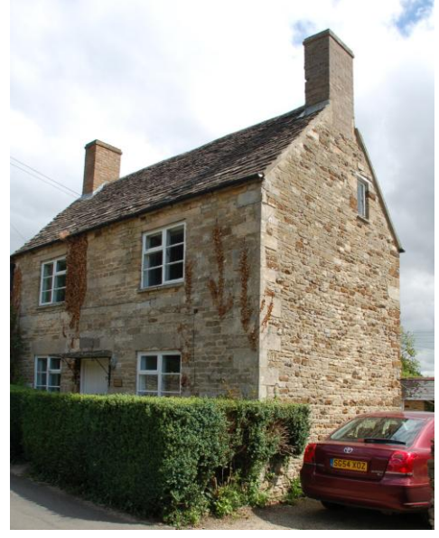
Chancel Cottage, from the SW.

The cottage is an L-shaped building, with a symmetrical west façade facing the road, and a rearward extension to the east from its northern end. The front and the extension are roofed in old Stonesfield slates, but the back slope of the main block is in modern cement tiles. There is no visible evidence that the building was ever thatched. On the façade the upstairs windows have narrow stone lintels constructed in three sections, the middle sections being supported by diagonal cuts, in the manner of keystones.