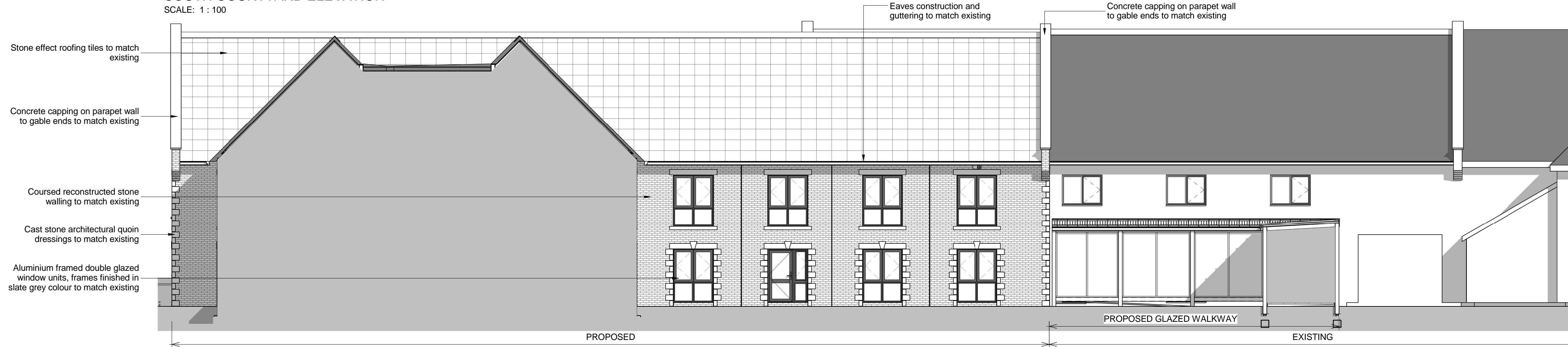
EAST COURTYARD ELEVATION SCALE: 1 : 100