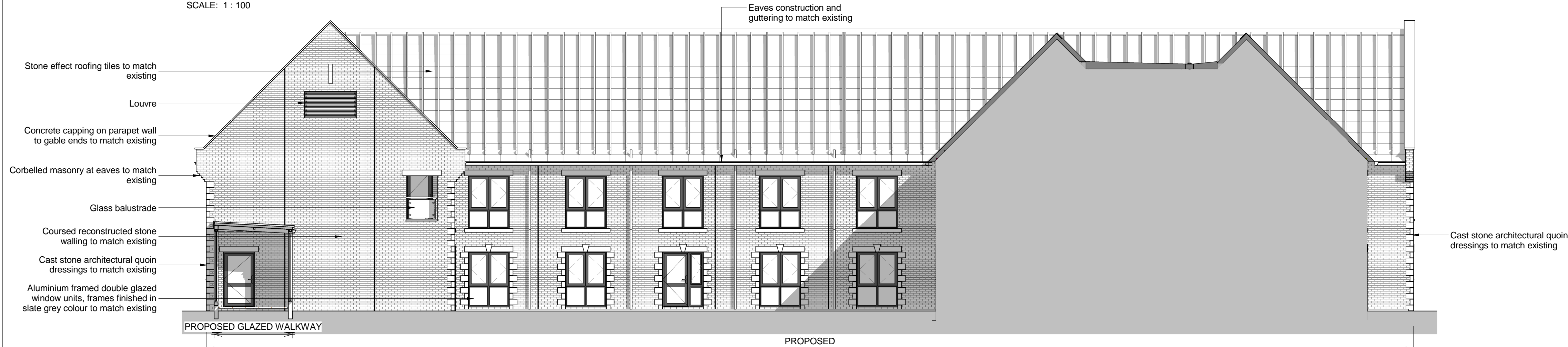
WEST COURTYARD ELEVATION SCALE: 1 : 100