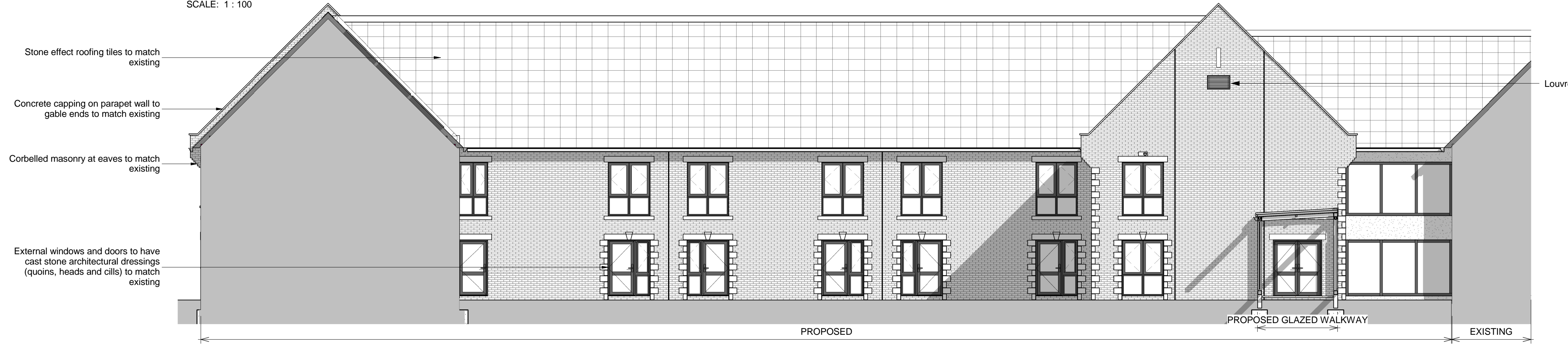
NORTH COURTYARD ELEVATION SCALE: 1 : 100