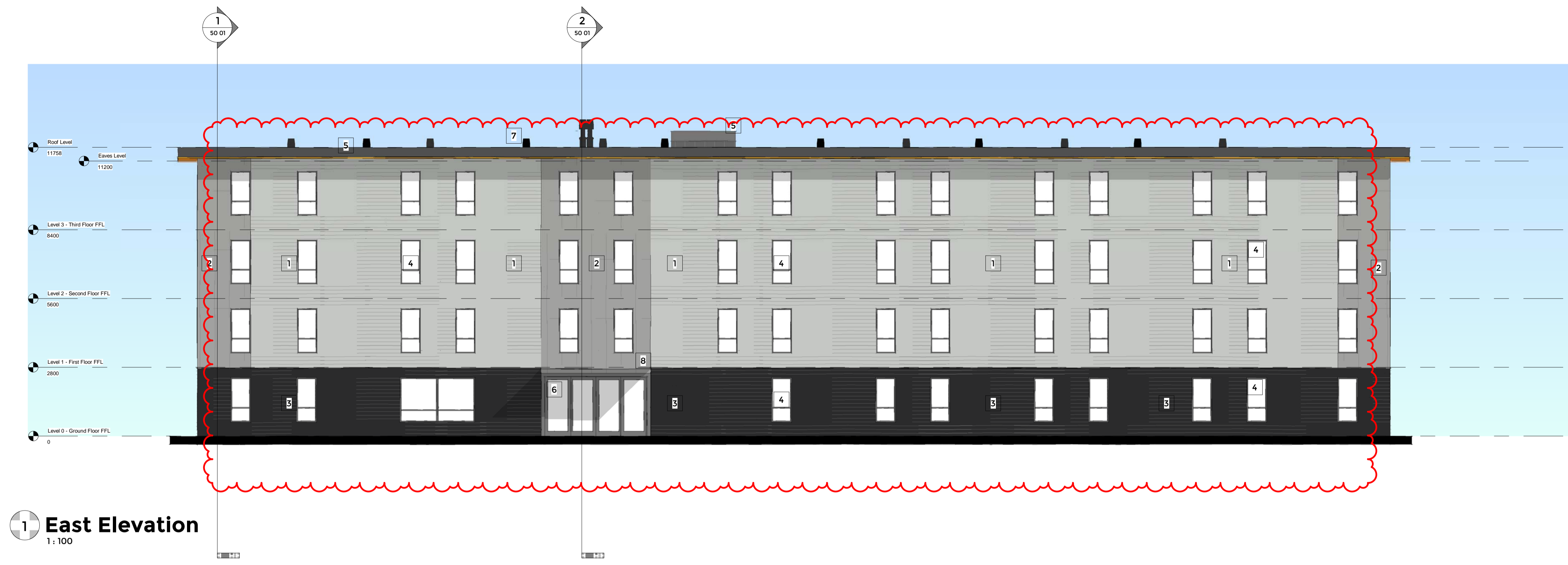
1 East Elevation 1:100