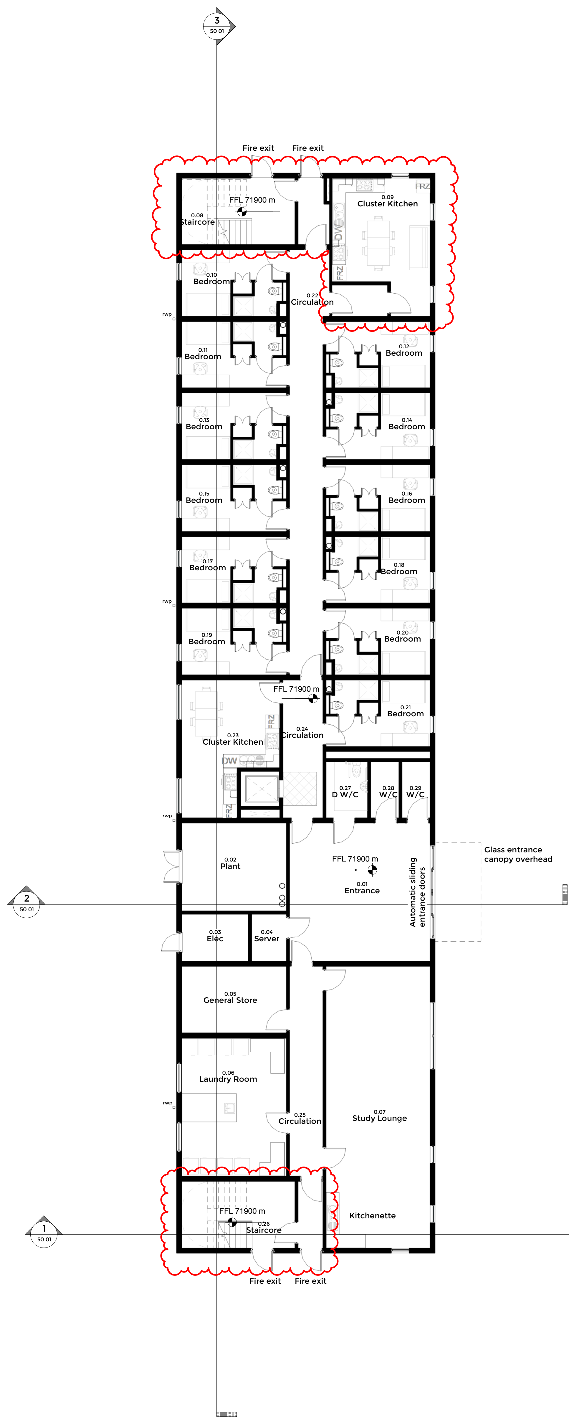
1 Level 0 - Ground Floor FFL 1:100