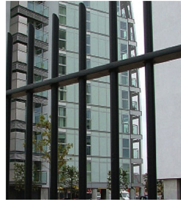
GRAMM - StyleGuard Vertical bar Railing