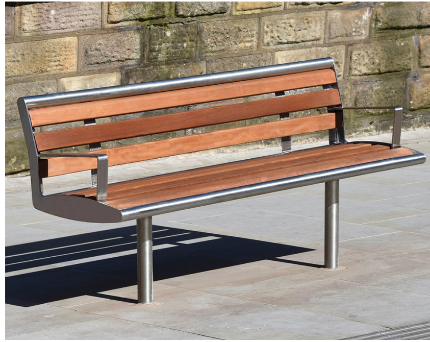
Broxap - Thornhill Stainless Steel Seat with Iroko Timber Slats and Flat arms