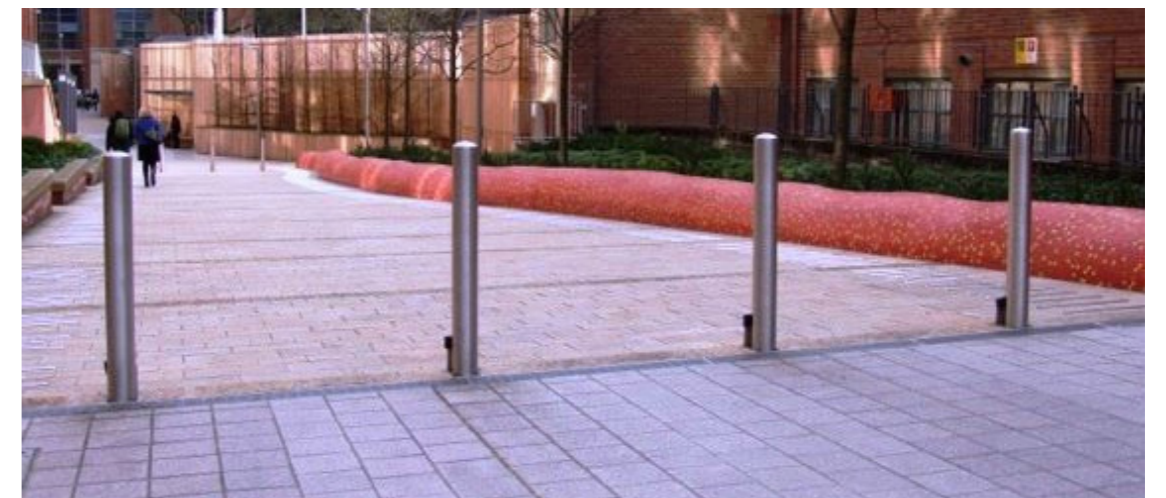
Blueton domed top removable stainless steel bollard