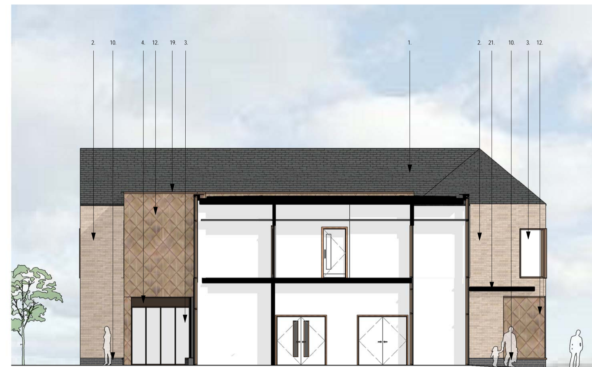
Building 455 - Section BB 1 : 100