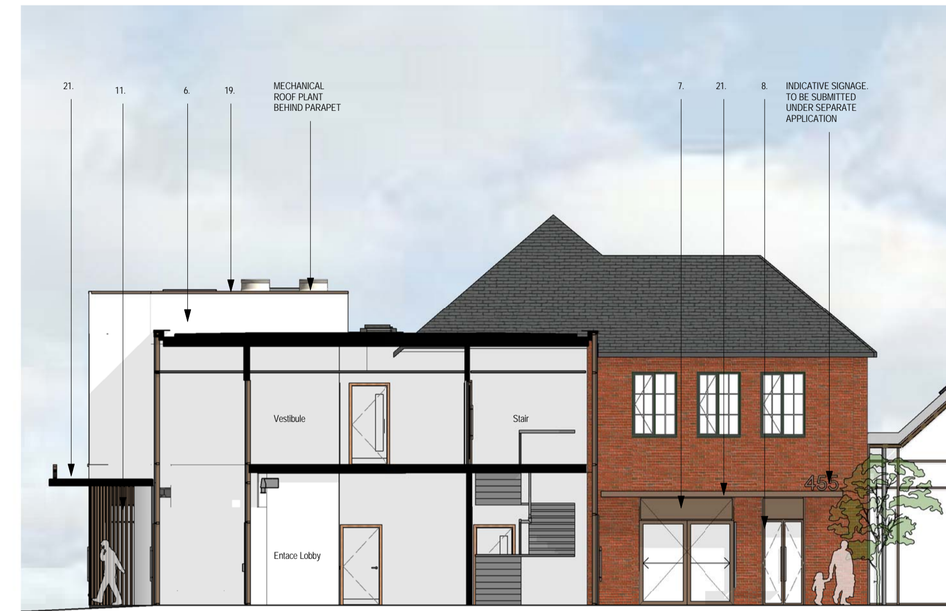
Building 455 - Section AA 1 : 100