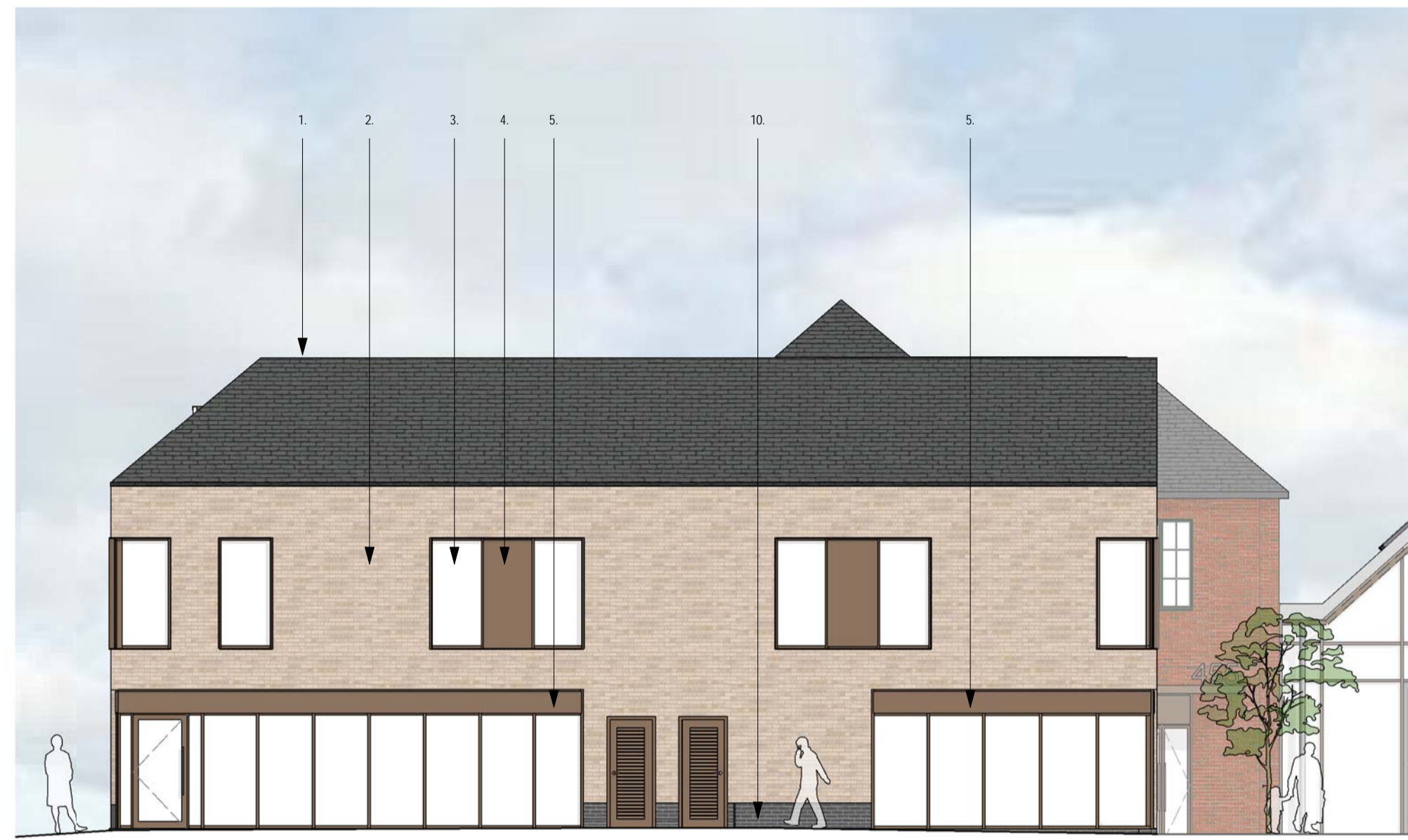
Building 455 - Proposed North Elevation 1 : 100