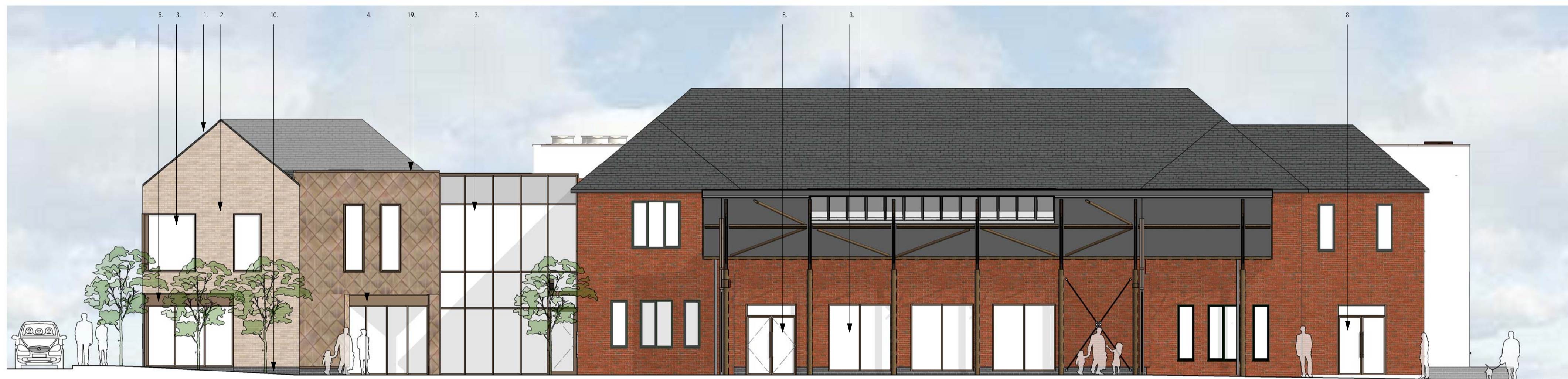
Building 455 - Proposed West Elevation 1:100

NOTE: TO BE READ IN CONJUNCTION WITH DESIGN AMENDMENT SCHEDULE FOR DESIGN DEVELOPMENT CHANGES TO APPROVED PLANNING SCHEME. TO BE READ IN CONJUNCTION WITH JESTICO AND BILES APPROVED PLANNING DOCUMENTS 2738-JW-110, 2738-JW-111, 2738-JW-112, 2738-JW-113, 2738-JW-114, 2738-JW-115, 2738-JW-116, 2738-JW-210, 2738-JW-211, 2738-JW-212, 2738-JW-213, 2738-JW-214, 2738-JW-220, 2738-JW-222, 2738-JW-230, 2738-JW-231