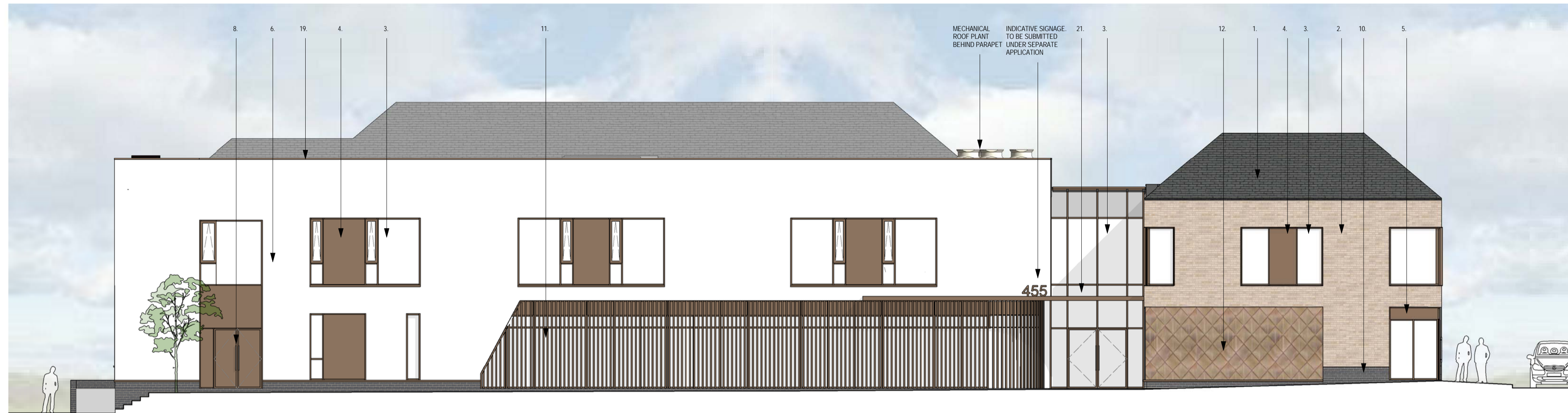
Building 455 - Proposed East Elevation 1:100

NOTE: TO BE READ IN CONJUNCTION WITH DESIGN AMENDMENT SCHEDULE FOR DESIGN DEVELOPMENT CHANGES TO APPROVED PLANNING SCHEME. TO BE READ IN CONJUNCTION WITH JESTICO AND BILES APPROVED PLANNING DOCUMENTS 2738-JW-110, 2738-JW-111, 2738-JW-112, 2738-JW-113, 2738-JW-114, 2738-JW-115, 2738-JW-116, 2738-JW-210, 2738-JW-211, 2738-JW-212, 2738-JW-213, 2738-JW-214, 2738-JW-220, 2738-JW-222, 2738-JW-230, 2738-JW-231