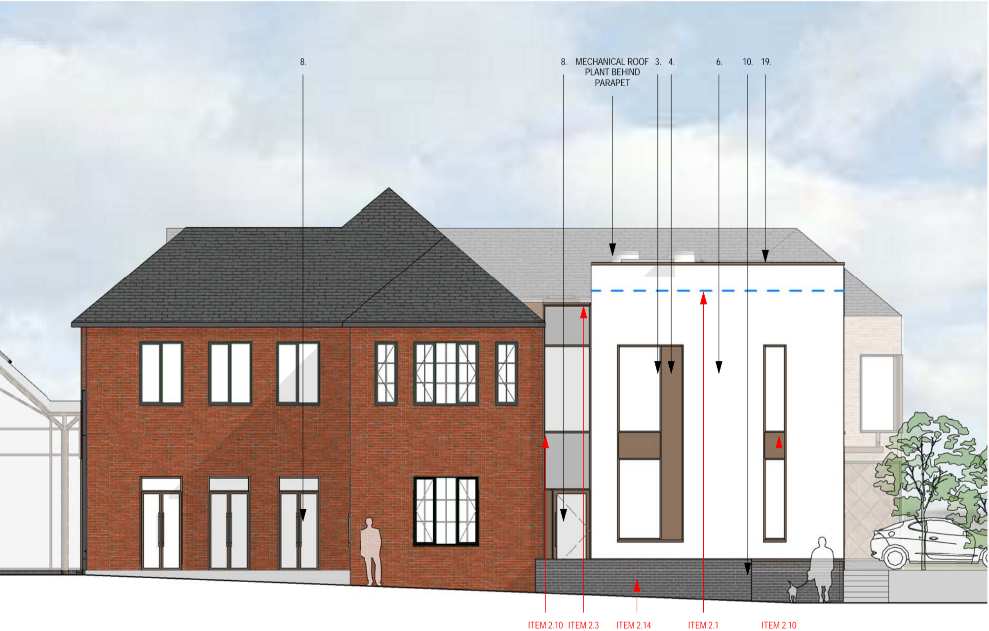
Building 455 - Proposed South Elevation 1 : 100