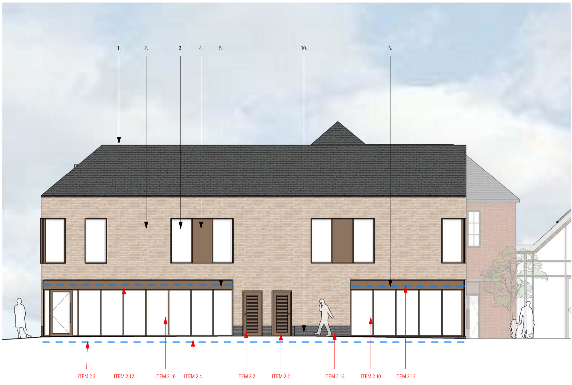
Building 455 - Proposed North Elevation 1 : 100

NOTE: TO BE READ IN CONJUNCTION WITH DESIGN AMENDMENT SCHEDULE FOR DESIGN DEVELOPMENT CHANGES TO APPROVED PLANNING SCHEME. TO BE READ IN CONJUNCTION WITH JESTICO AND WHILES APPROVED PLANNING DOCUMENTS: 2738-JW-110, 2738-JW-111, 2738-JW-112, 2738-JW-113, 2738-JW-114, 2738-JW-115, 2738-JW-116, 2738-JW-210, 2738-JW-211, 2738-JW-212, 2738-JW-213, 2738-JW-214, 2738-JW-220, 2738-JW-222, 2738-JW-230, 2738-JW-231