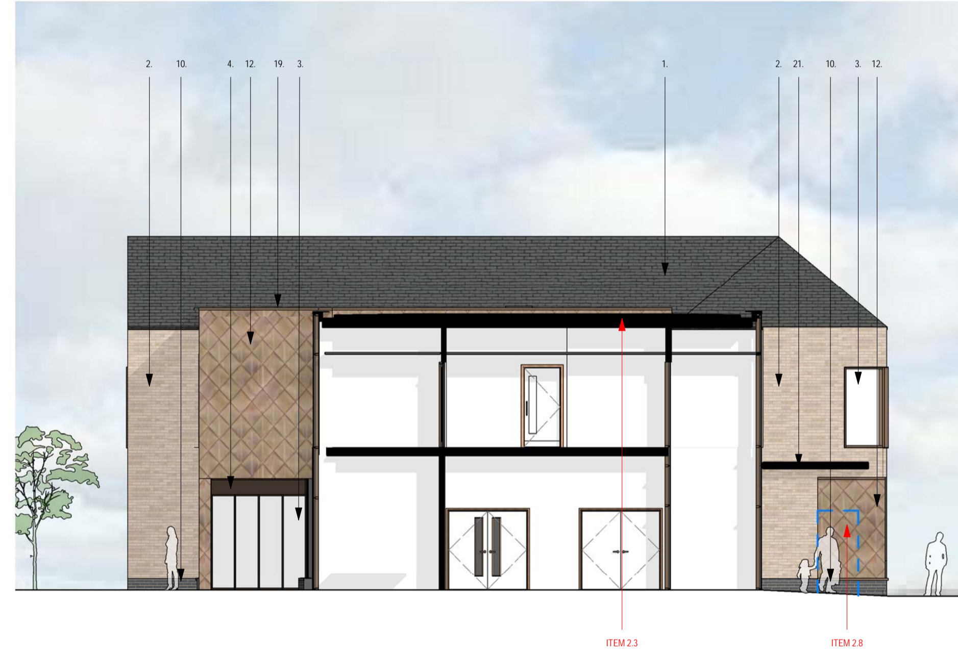
Building 455 - Section BB 1 : 100