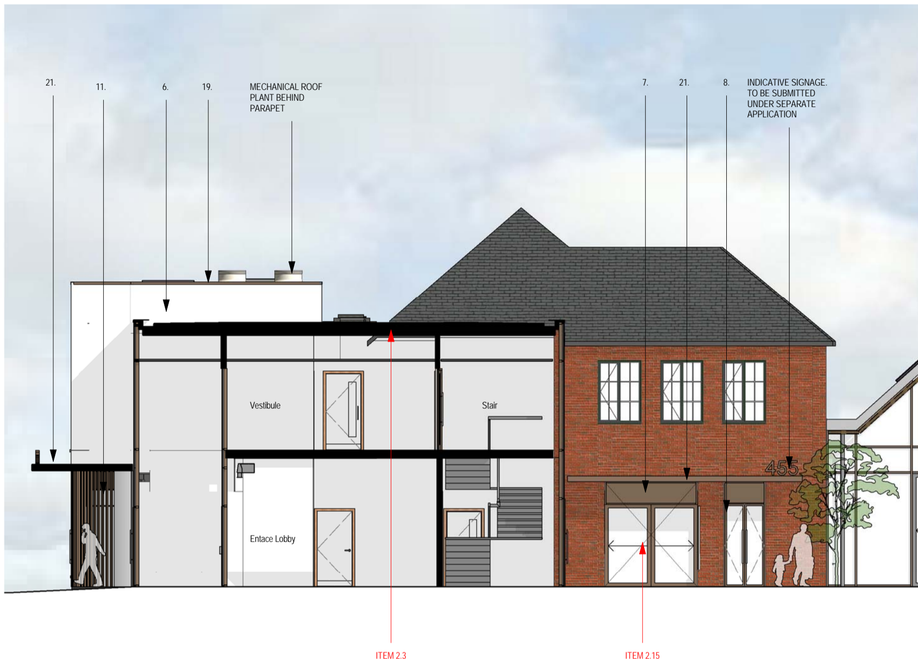
Building 455 - Section AA 1 : 100