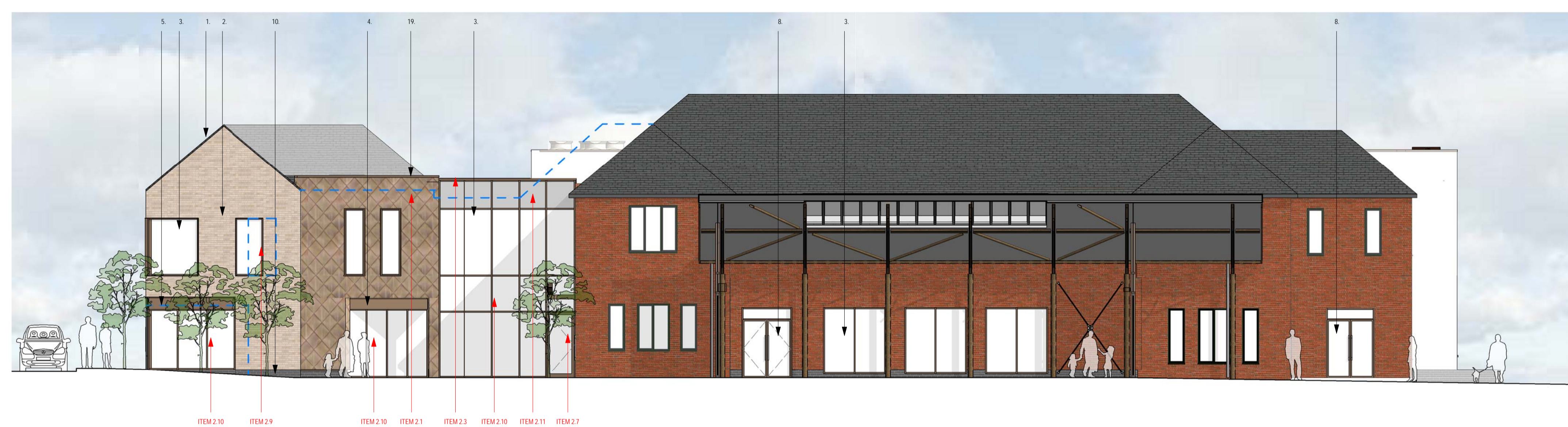
Building 455 - Proposed West Elevation 1 : 100