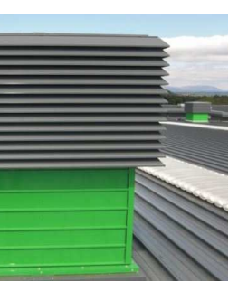
Breathing Buildings Ventilation Turret