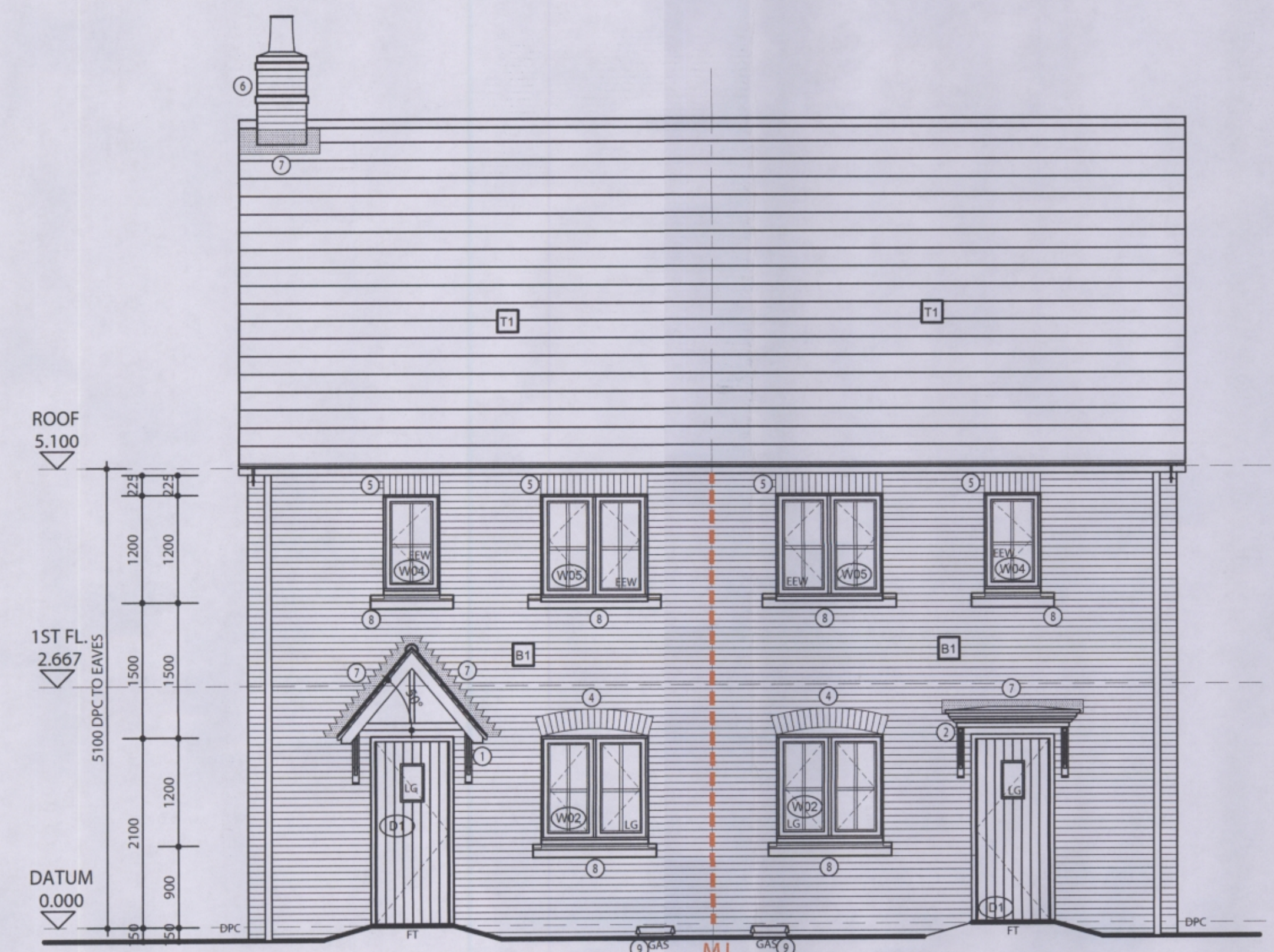
FRONT ELEVATION PLOT C1 (as 50,93,138,142,149,162). PLOT C2 (opp 51,94,139,143,150,163).