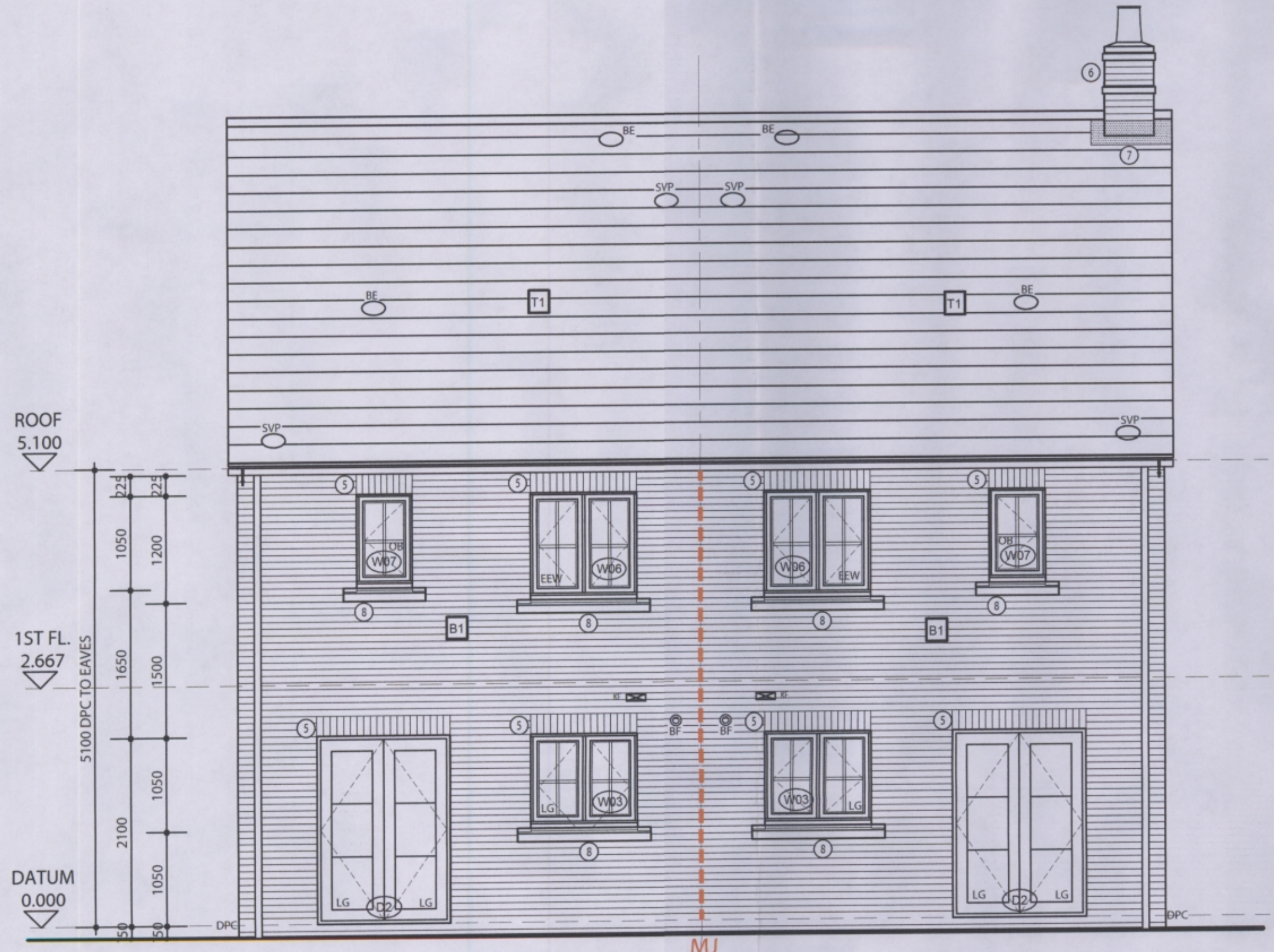
REAR ELEVATION PLOT C2 (opp 51,94,139,143,150,163). PLOT C1 (as 50,93,138,142,149,162).