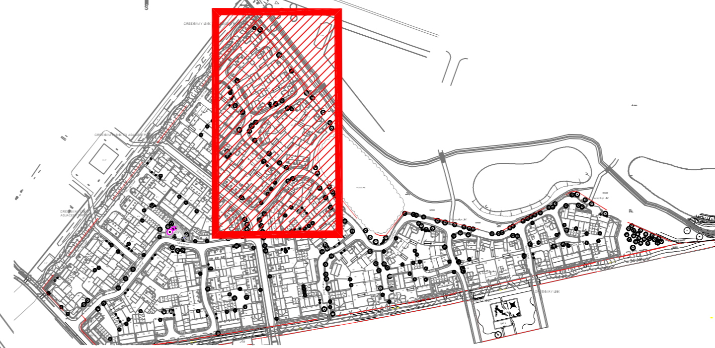
Key Plan NTS