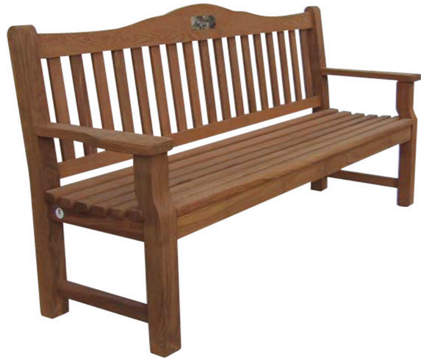
Orchard Street Furniture - Traditional Seat, Iroko with flat arms