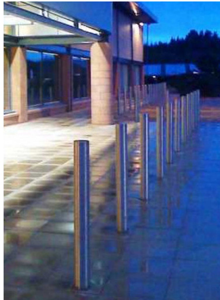
Blueton domed top stainless steel bollard