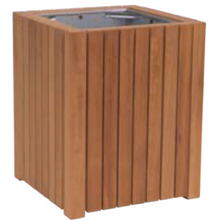
Orchard Street Furniture - Jefferson Litter Bin, Iroko Woolbrook