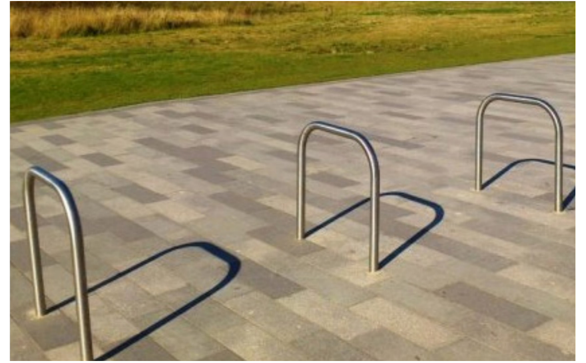
Blueton Cycle Stands