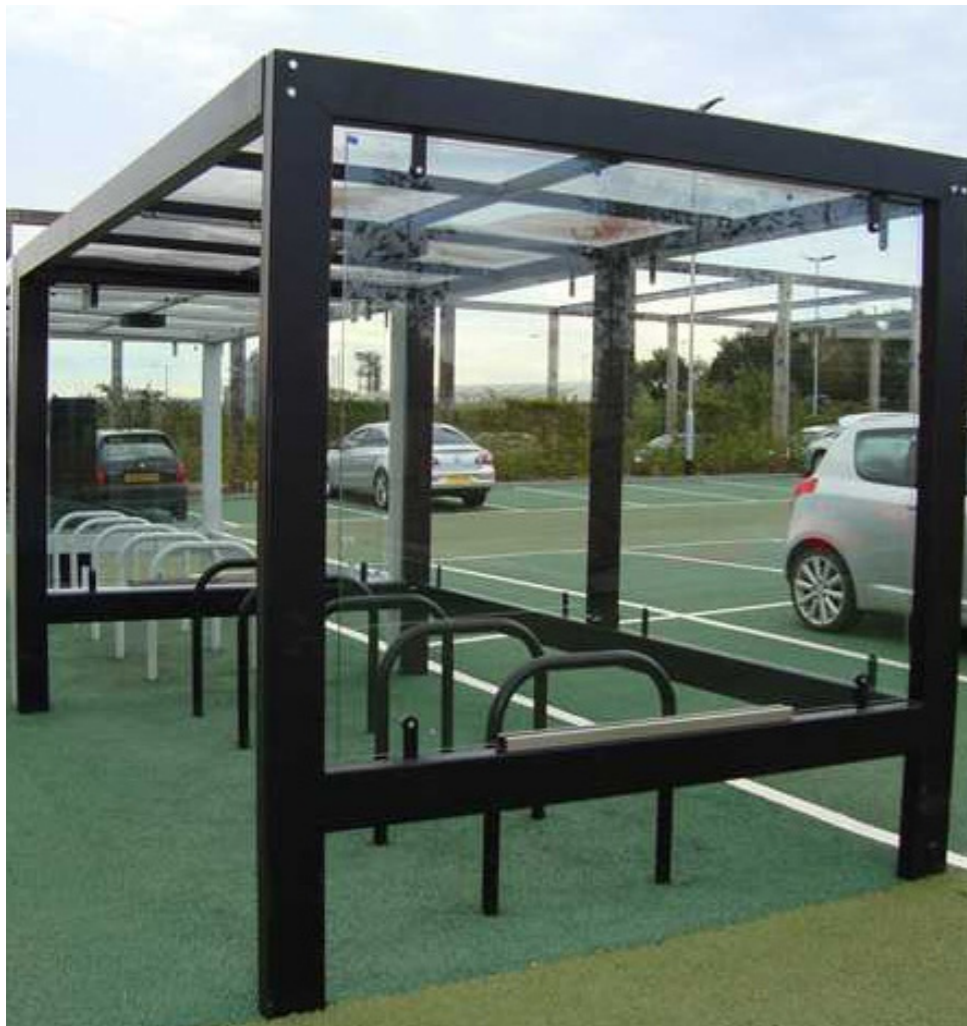
Blueton 'Cube' cycle shelter