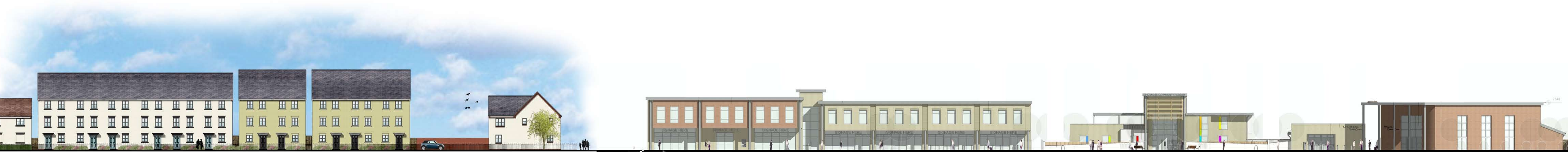
PLOT 11 S308 PLOT 12 S308 PLOT 13 S308 PLOT 14 S308 PLOT 15 S308 PLOT 16 S308 PLOT 17 S408 PLOT 18 S408 PLOT 19 S408 PLOT 20 S408 PLOT 21 S408 PLOT 22 C4006