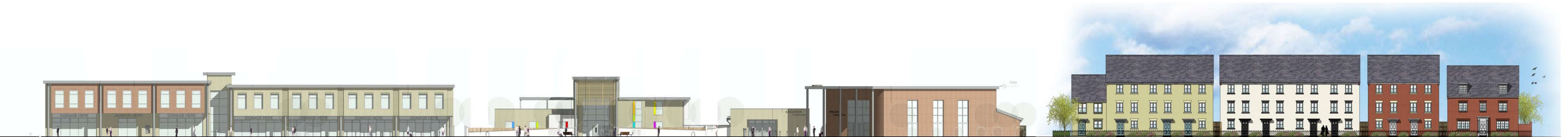
PLOT 123 S241 PLOT 124 S308 PLOT 125 S308 PLOT 126 S308 PLOT 127 S308 PLOT 128 S308 PLOT 129 S308 PLOT 130 S308 PLOT 131 S308 PLOT 132 S308 PLOT 133 P504

Context information obtained from Cherwell planning web site which may have been subject to alteration at a later date.