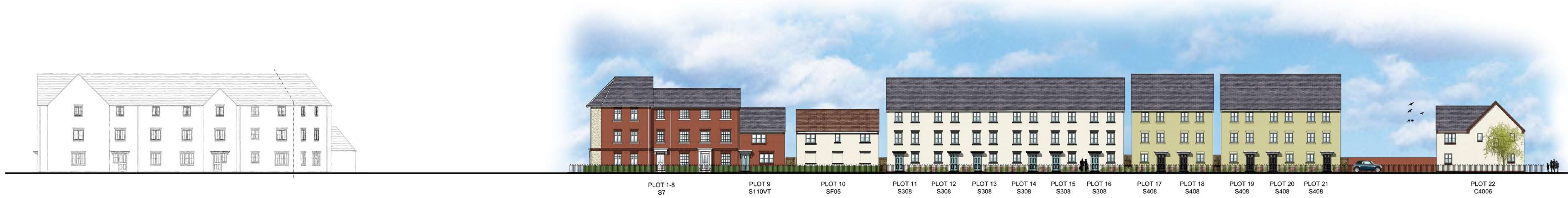
PLOT 1-8 S7 PLOT 9 S110VT PLOT 10 SF05 PLOT 11 S308 PLOT 12 S308 PLOT 13 S308 PLOT 14 S308 PLOT 15 S308 PLOT 16 S308 PLOT 17 S408 PLOT 18 S408 PLOT 19 S408 PLOT 20 S408 PLOT 21 S408 PLOT 22 C4006