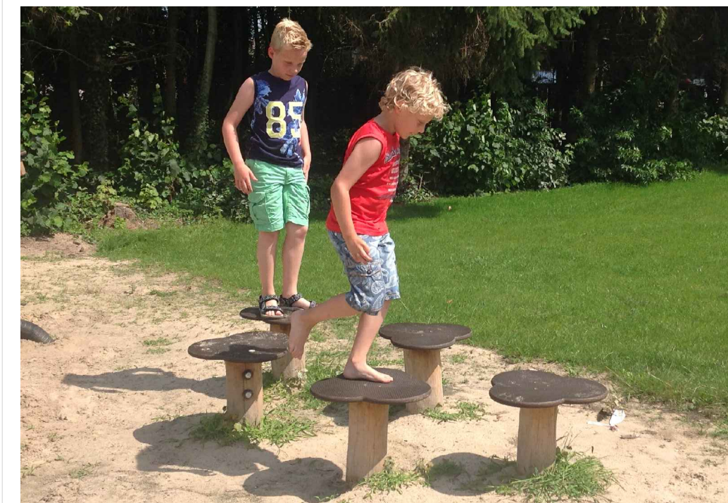
Balance Post Waterlilies NRO820-0601