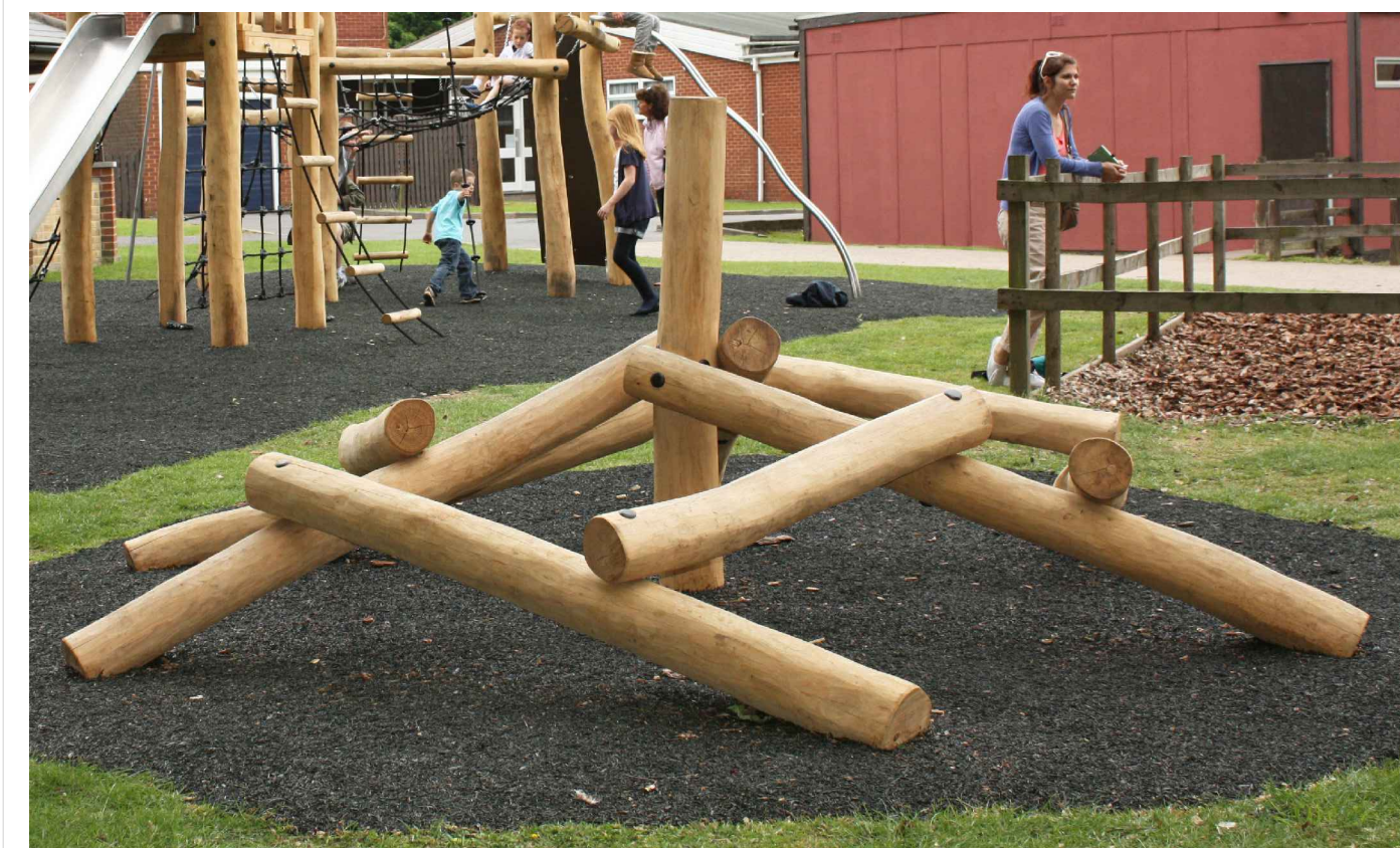
Crawling Pyramid NRO826-0601