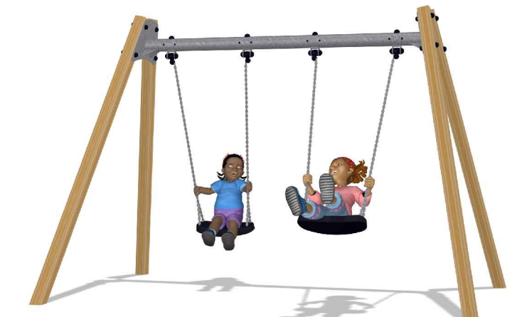
Double Swing (with Cradle Seats) SW900200-0601