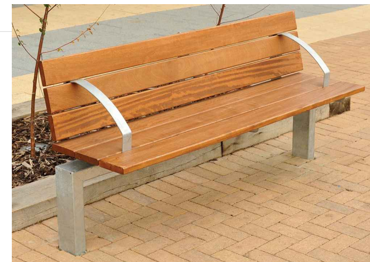
Willenhall Seat BX14 4015-BP