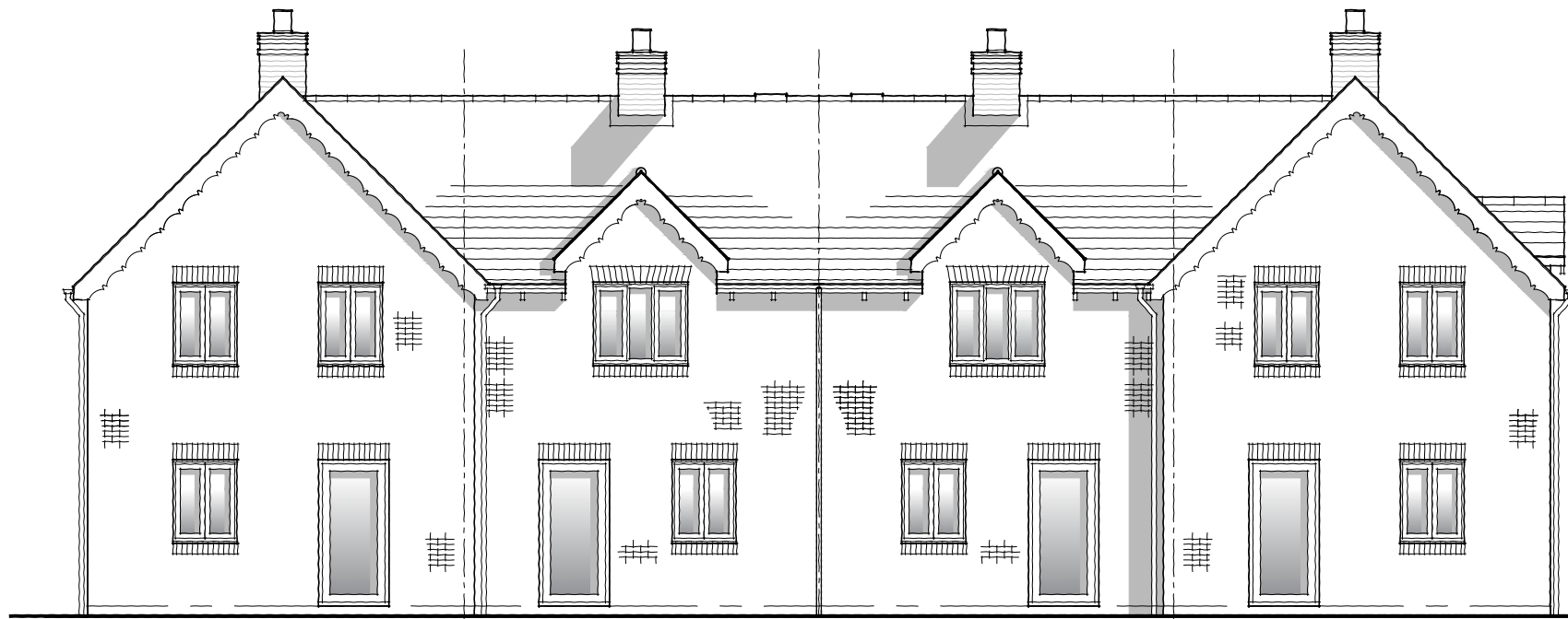
Plot 20 FRONT ELEVATION