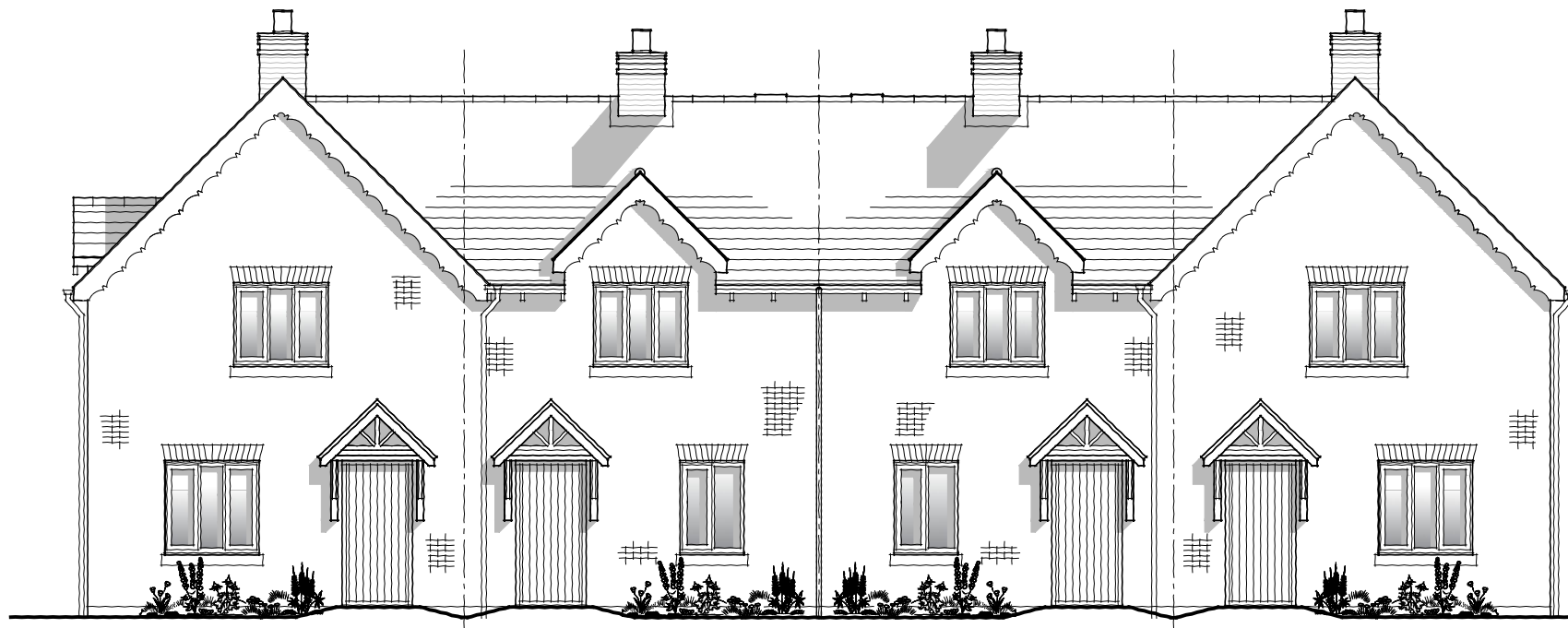
Plot 23 FRONT ELEVATION