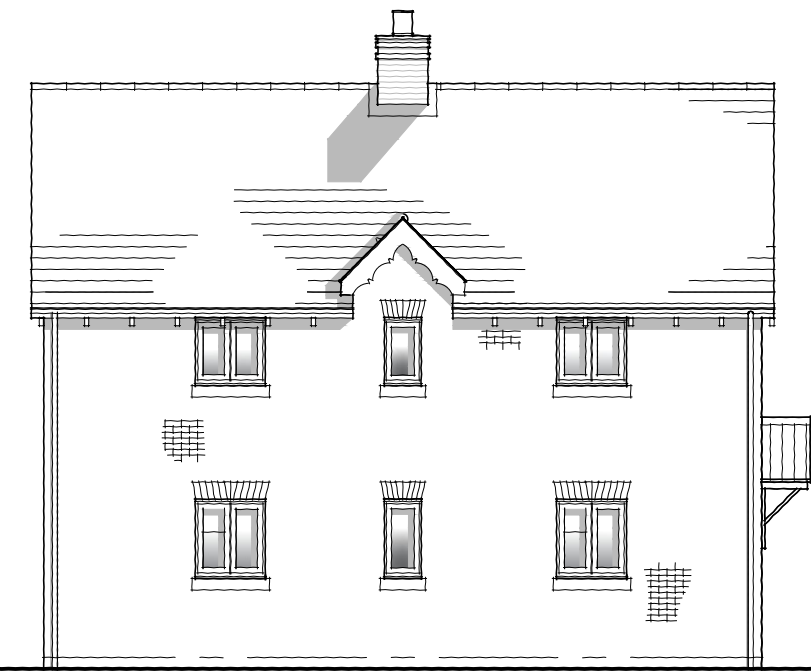
Plot 23 SIDE ELEVATION