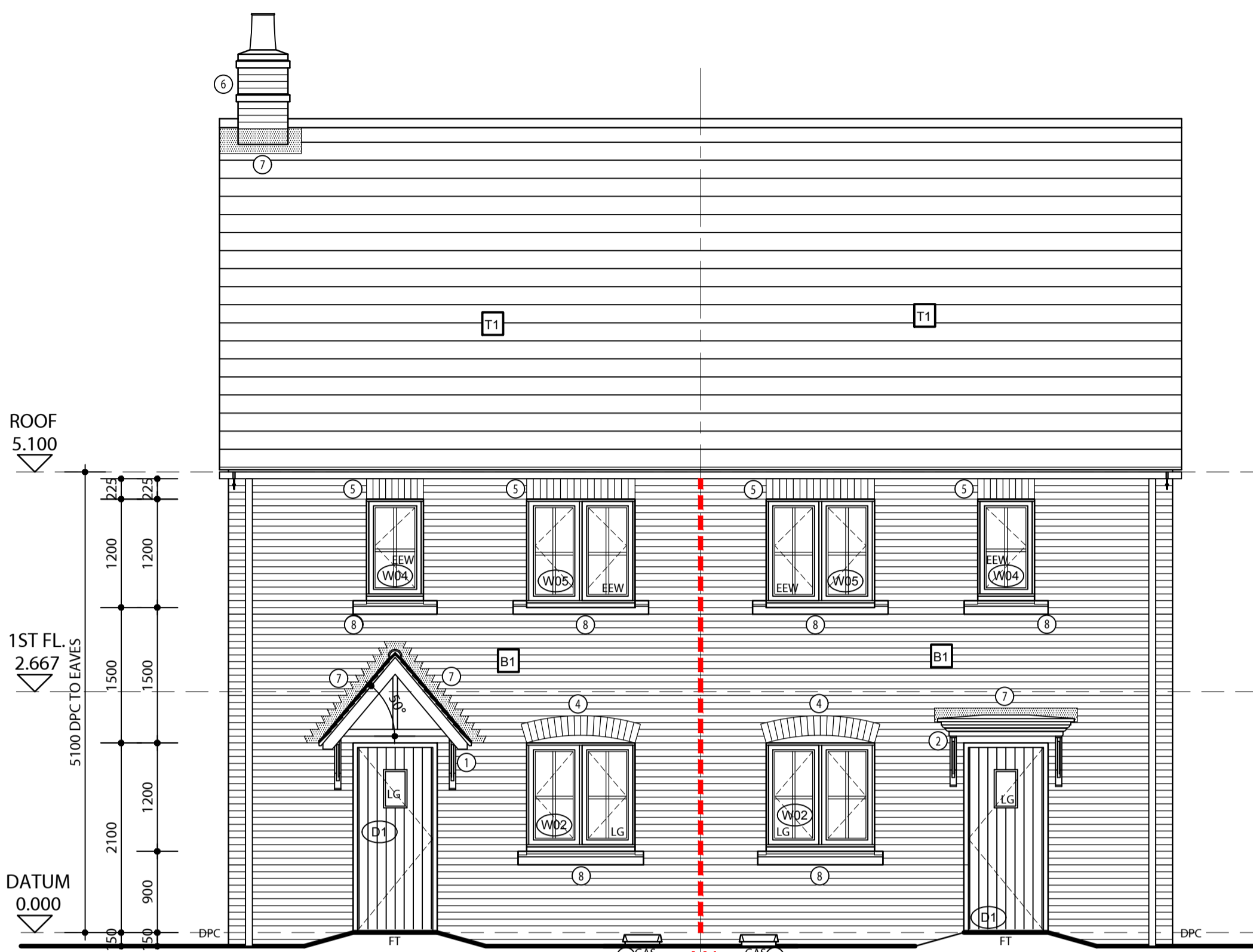
FRONT ELEVATION PLOT C1 (as 50,93,138,142,149,162). PLOT C2 (opp 51,94,139,143,150,163).