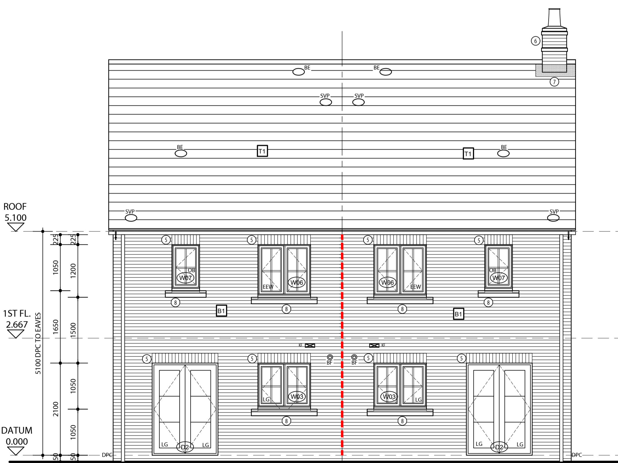
REAR ELEVATION PLOT C2 (opp 51,94,139,143,150,163). PLOT C1 (as 50,93,138,142,149,162).