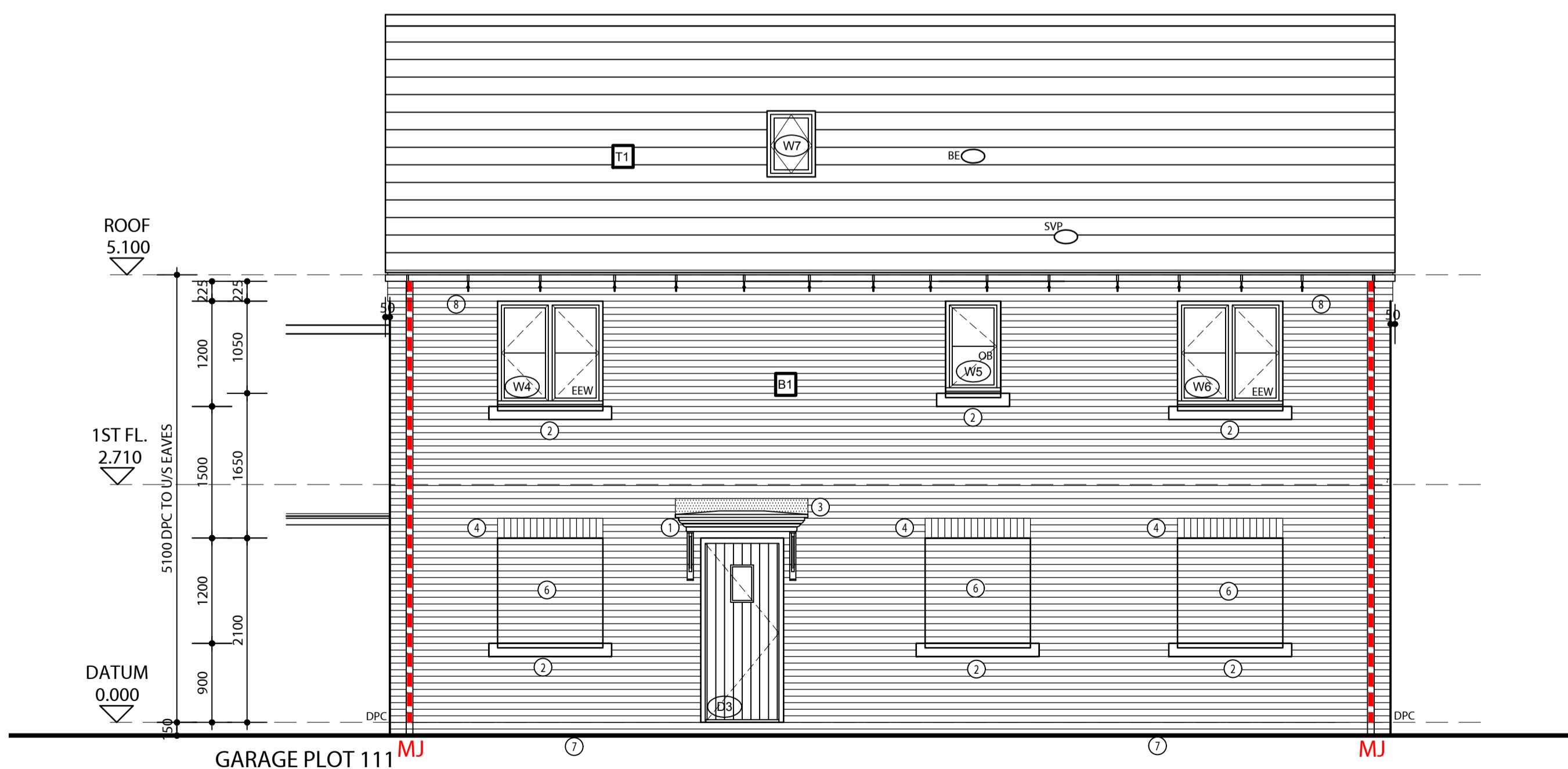
REAR ELEVATION TYPE A2 (as 108).