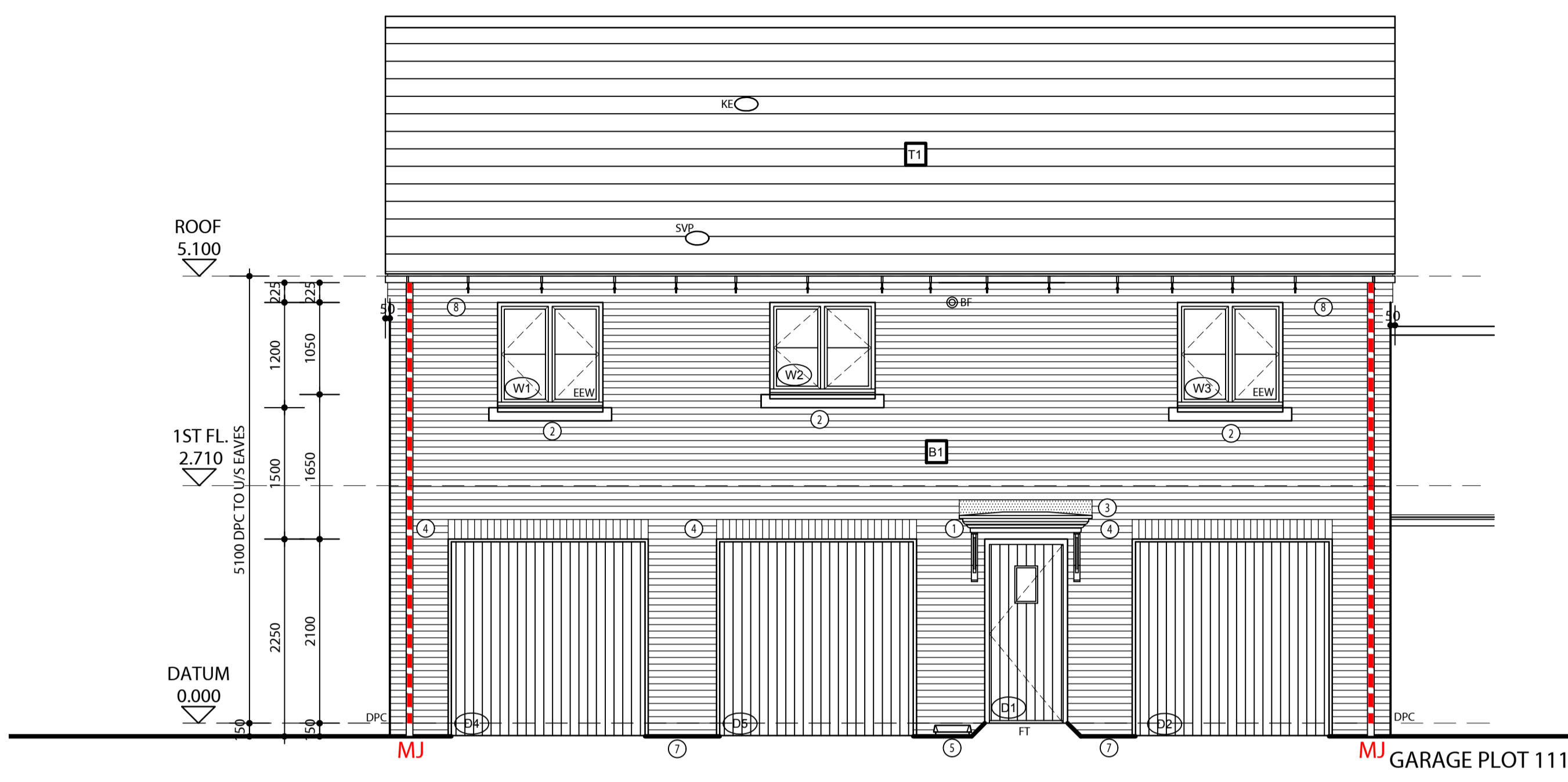
FRONT ELEVATION TYPE A2 (as 108).