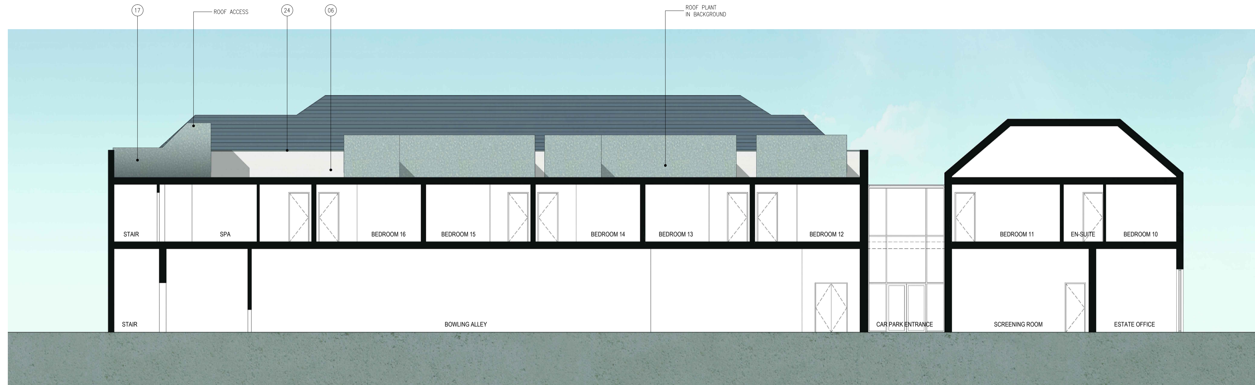
01 SECTION DD W-215 / 1:100