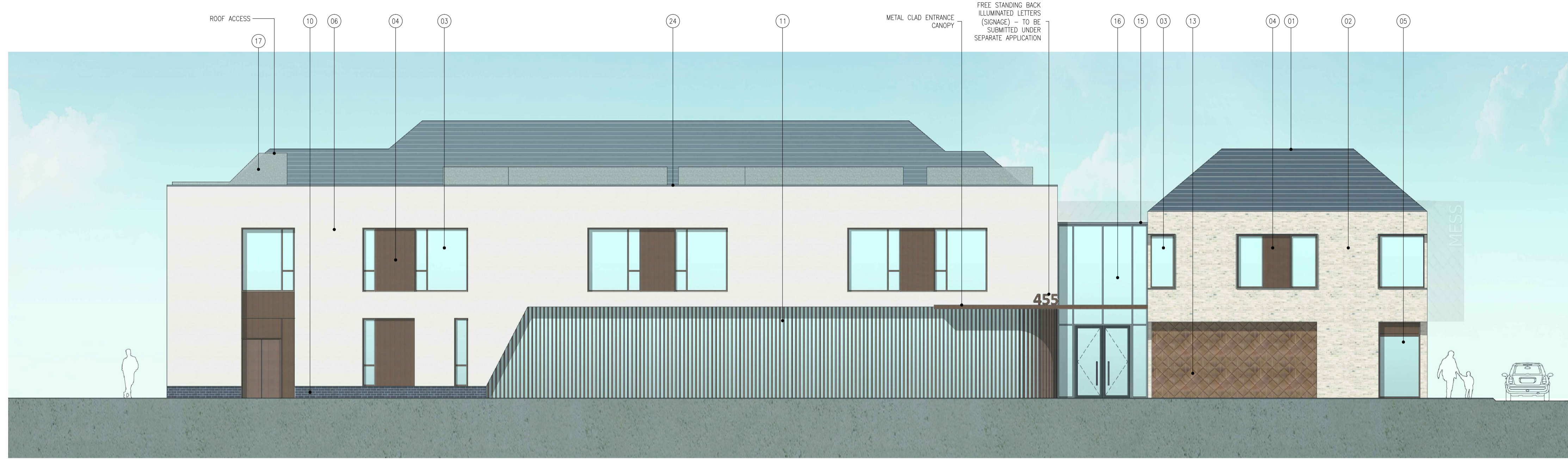
01 PROPOSED EAST ELEVATION JW-214 / 1:100