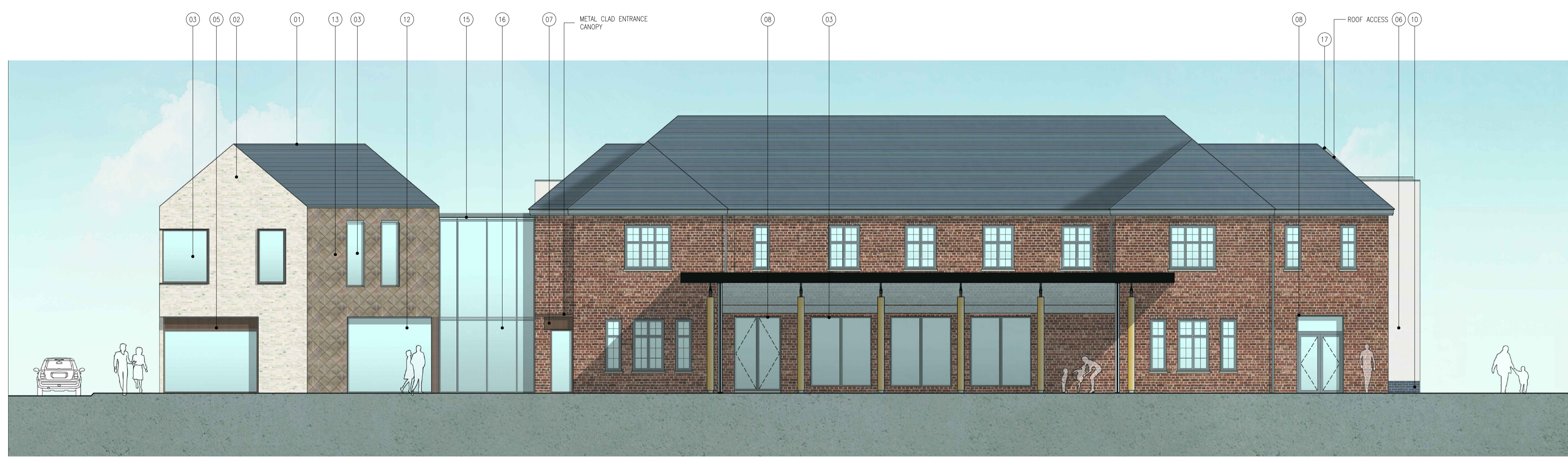
02 PROPOSED WEST ELEVATION / SECTION CC JW-214 / 1:100

DO NOT SCALE THIS DRAWING. ALL DIMENSIONS MUST BE CHECKED ON SITE. INFORM THE ARCHITECT OF ANY DISCREPANCIES PRIOR TO CONSTRUCTION.