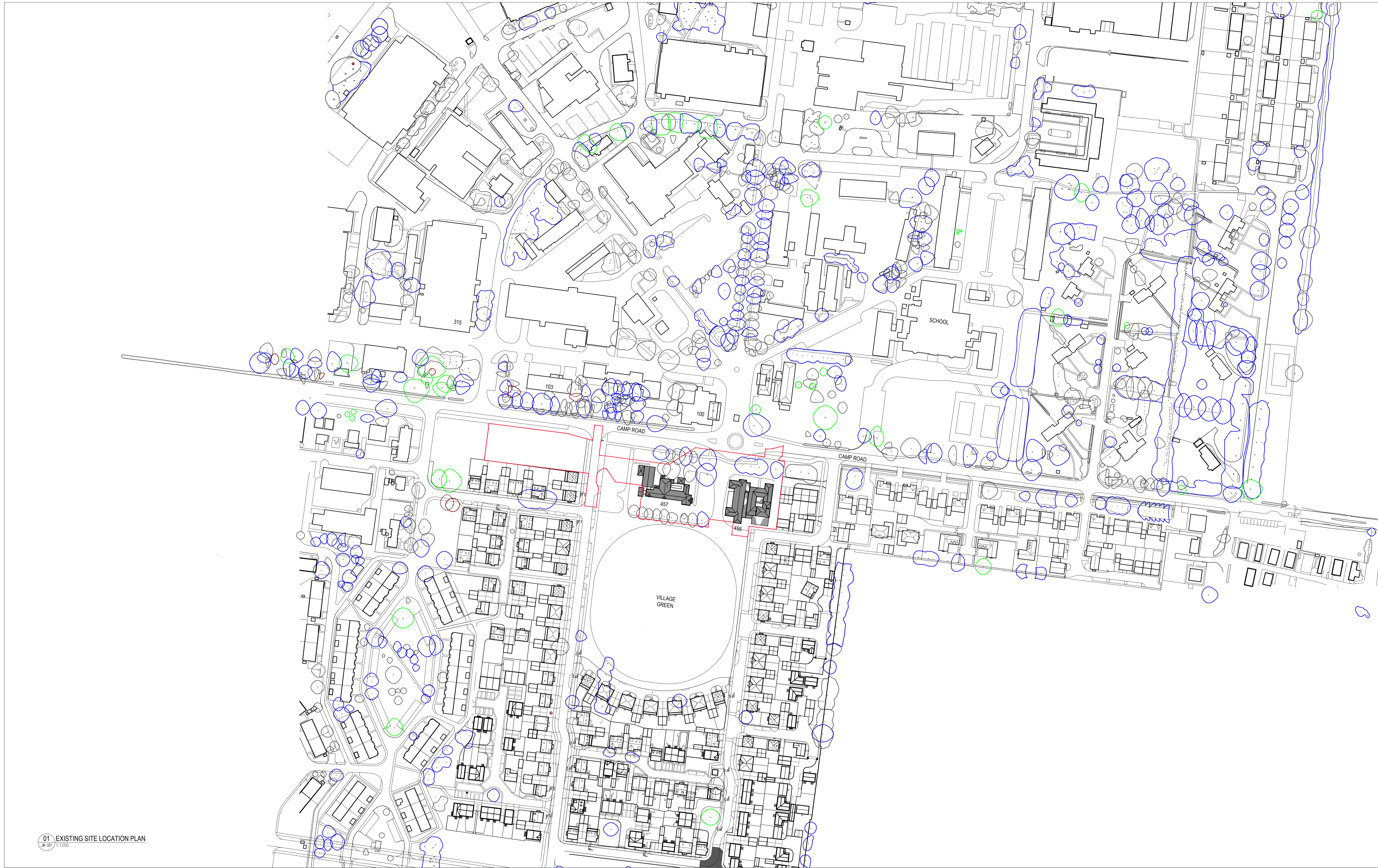
01 EXISTING SITE LOCATION PLAN JW-001 1:1250

DO NOT SCALE THIS DRAWING ALL DIMENSIONS MUST BE CHECKED ON SITE INFORM THE ARCHITECT OF ANY DISCREPANCIES PRIOR TO CONSTRUCTION