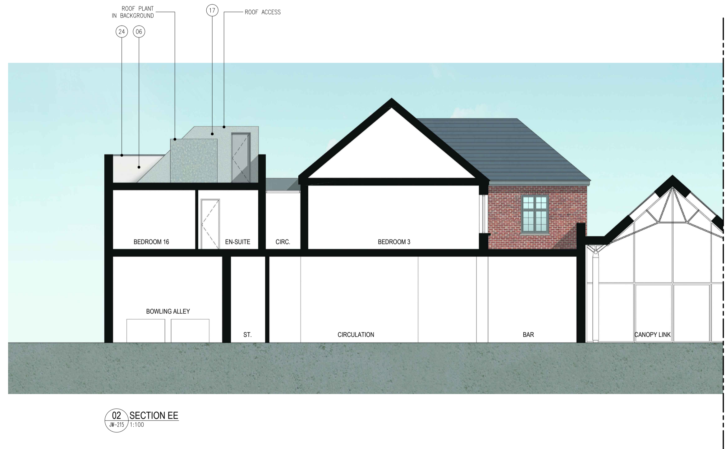
02 SECTION EE W-215 / 1:100

DO NOT SCALE THIS DRAWING. ALL DIMENSIONS MUST BE CHECKED ON SITE. INFORM THE ARCHITECT OF ANY DISCREPANCIES PRIOR TO CONSTRUCTION.