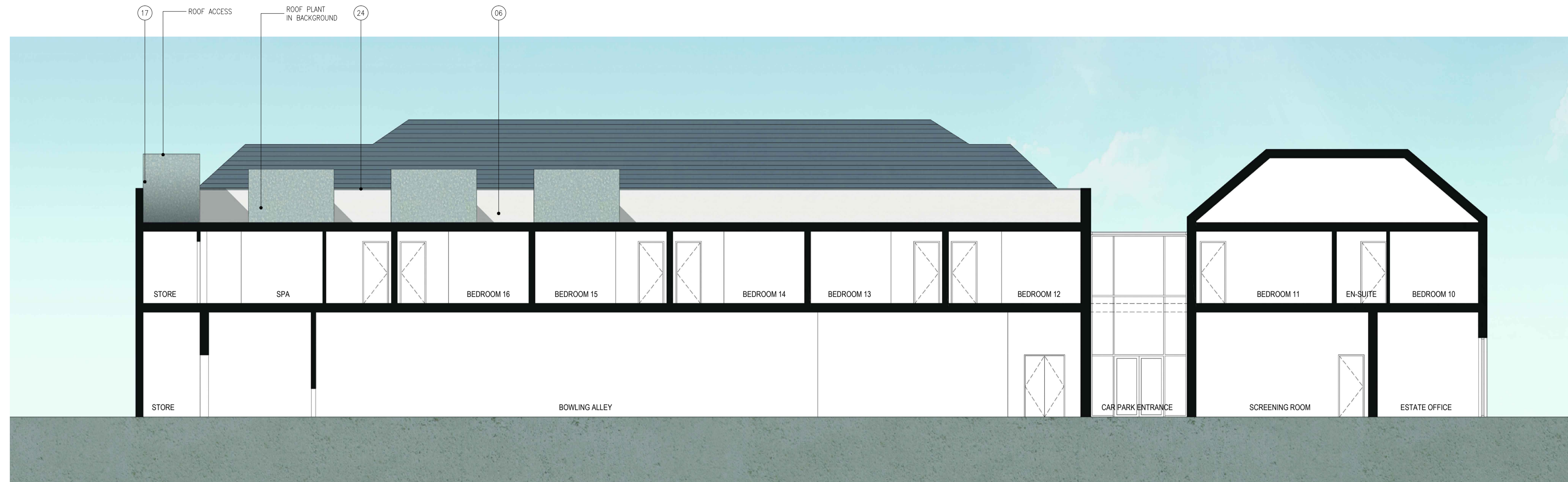
01 SECTION DD W-215 / 1:100