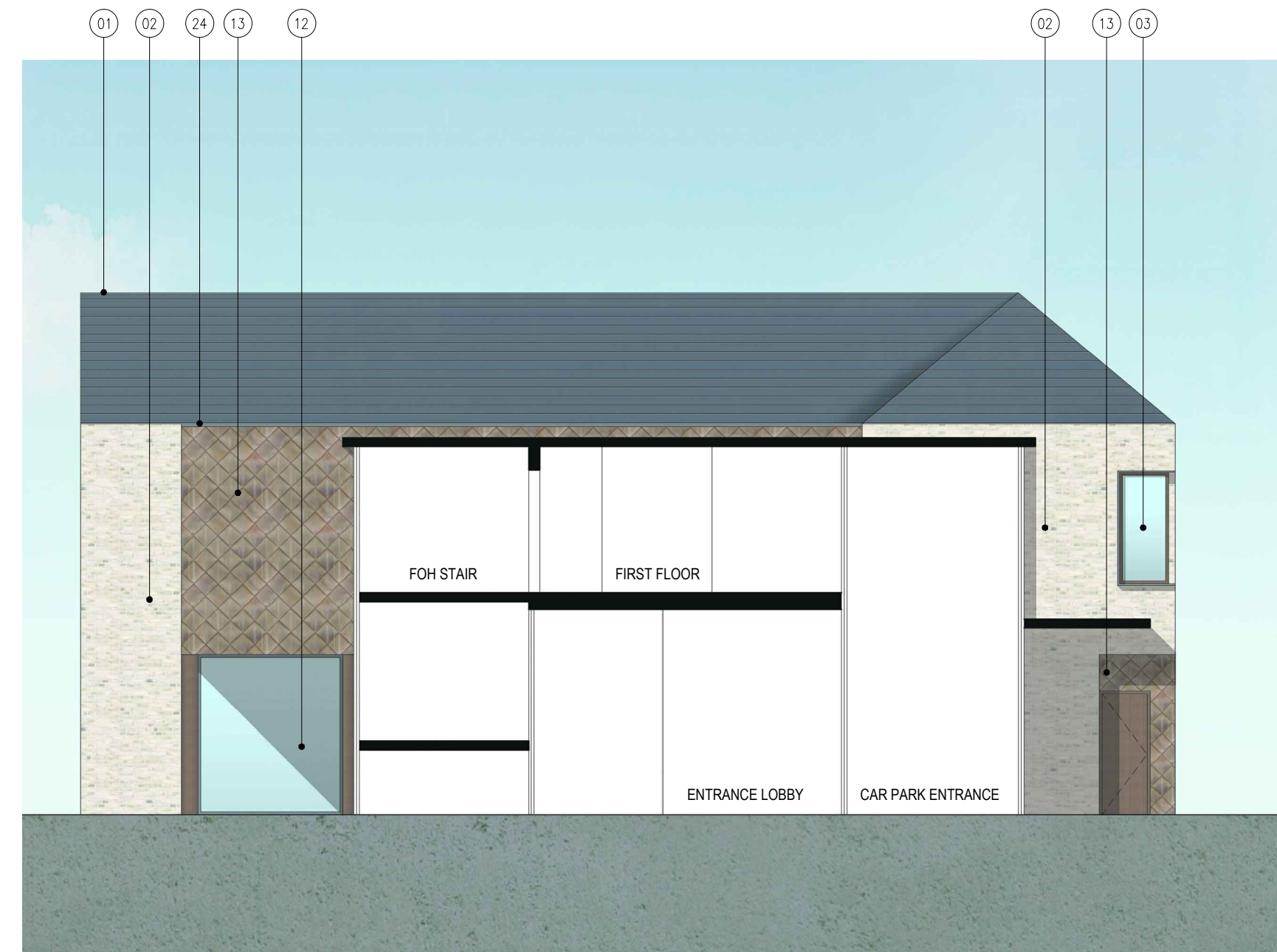
04 PROPOSED SOUTH ELEVATION / SECTION AA JW-213 1:100

DO NOT SCALE THIS DRAWING. ALL DIMENSIONS MUST BE CHECKED ON SITE. INFORM THE ARCHITECT OF ANY DISCREPANCIES PRIOR TO CONSTRUCTION.