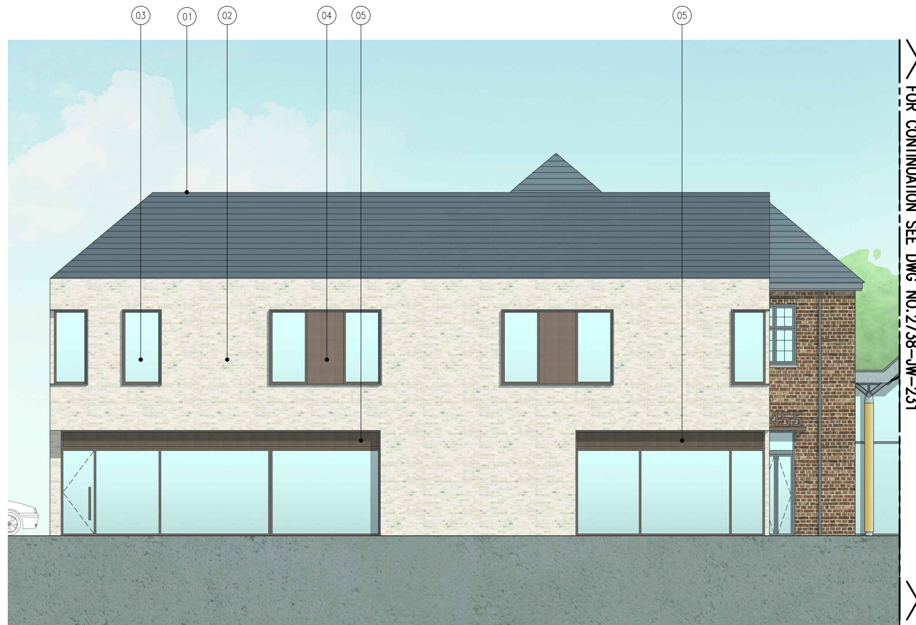
01 PROPOSED NORTH ELEVATION JW-213 1:100