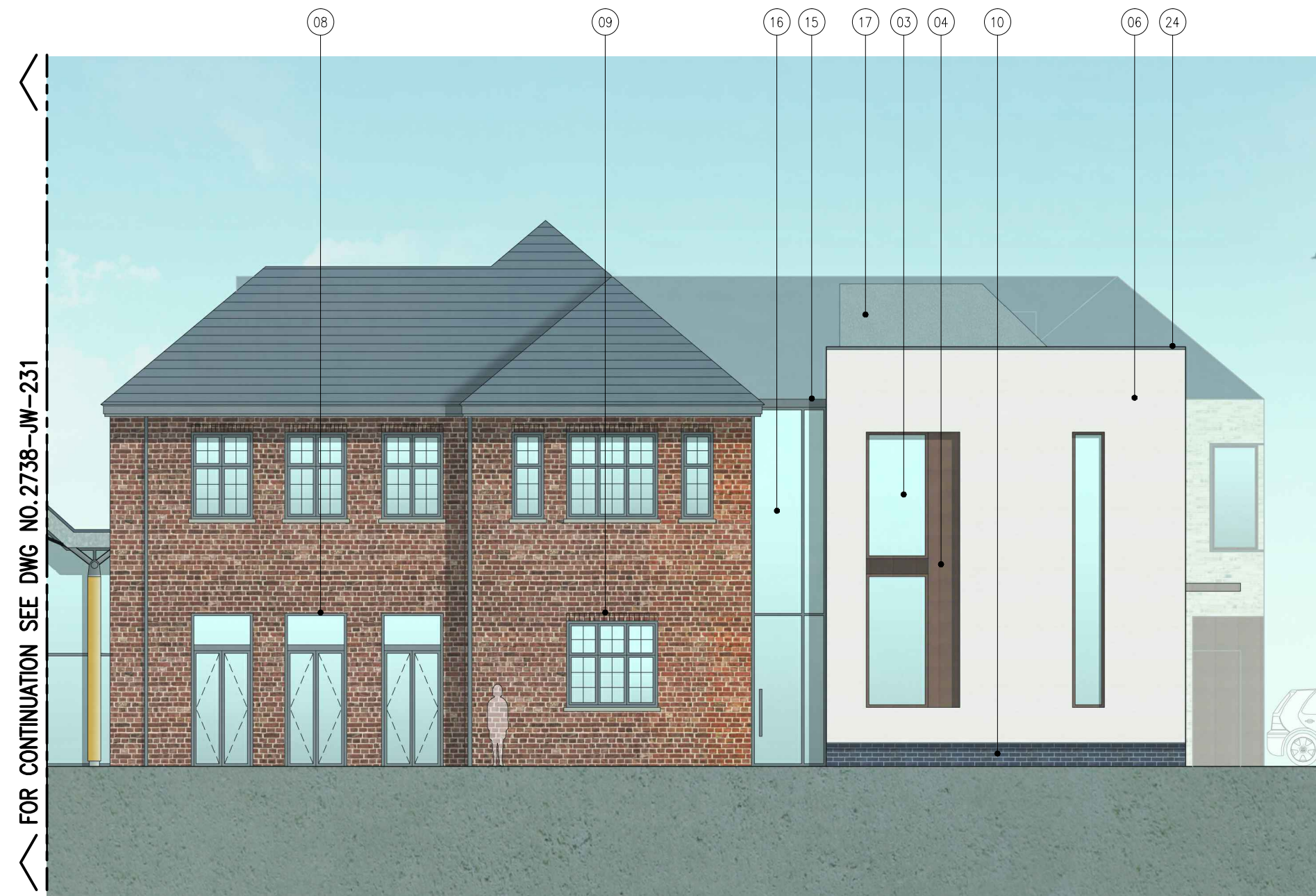
02 PROPOSED SOUTH ELEVATION JW-213 1:100