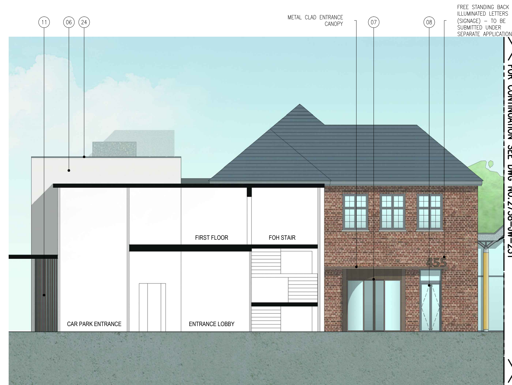
03 PROPOSED NORTH ELEVATION / SECTION BB JW-213 1:100