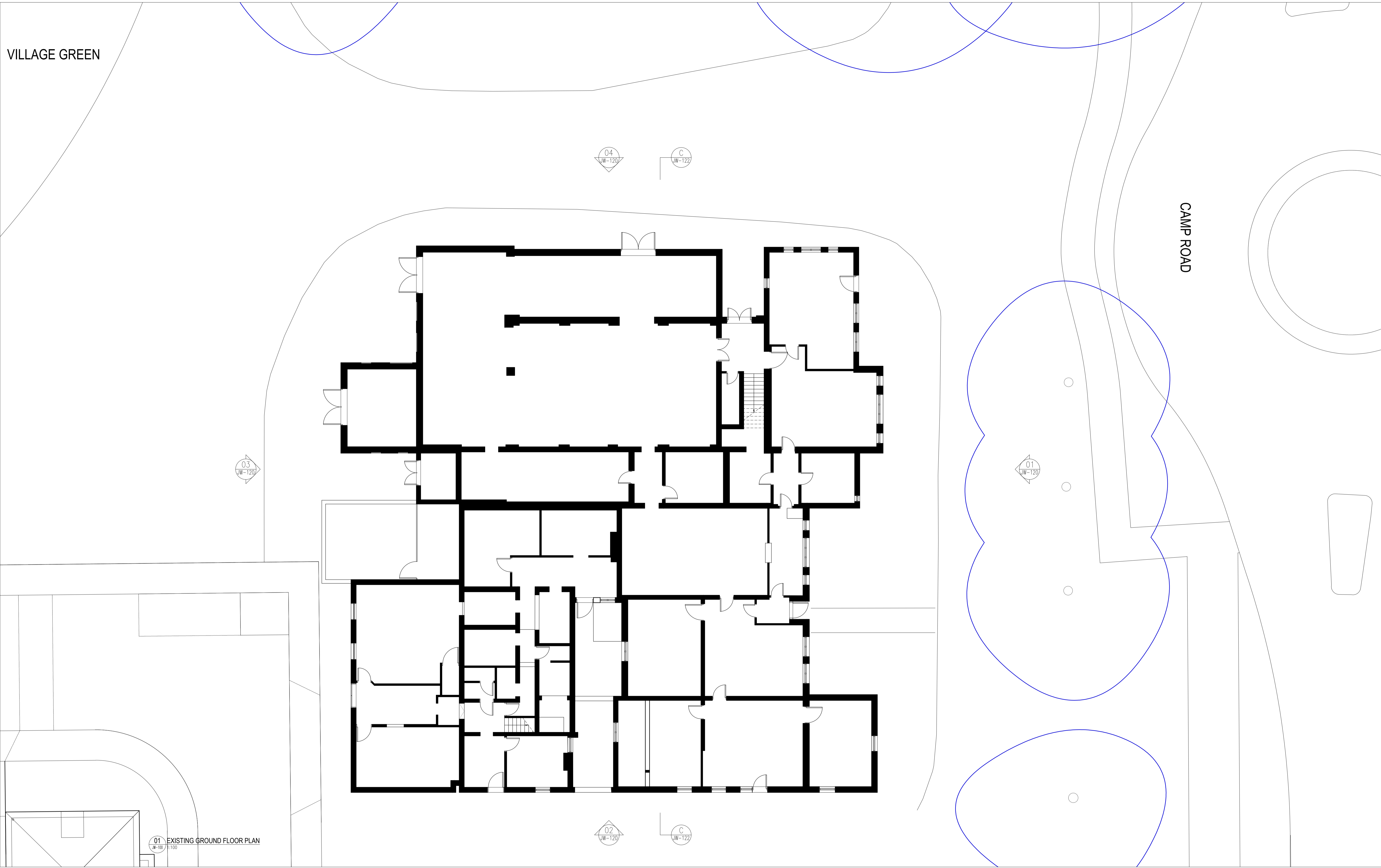
01 EXISTING GROUND FLOOR PLAN JW-100 1:100

DO NOT SCALE THIS DRAWING ALL DIMENSIONS MUST BE CHECKED ON SITE INFORM THE ARCHITECT OF ANY DISCREPANCIES PRIOR TO CONSTRUCTION