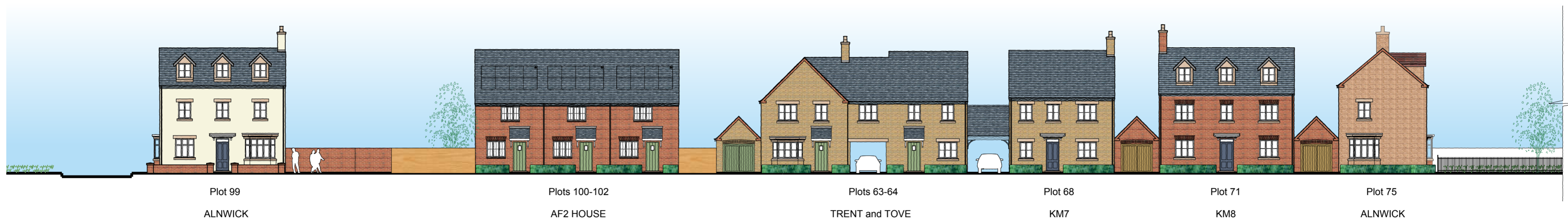
8 STREET SCENE C-C' - 1 Scale: 1:200

NOTES CONTRACTORS MUST VERIFY ALL DIMENSIONS ON SITE BEFORE COMMENCING ANY WORK ON SHOP DRAWINGS DO NOT SCALE FROM THIS DRAWING MCBAINS COOPER CONSULTING LTD COPYRIGHT