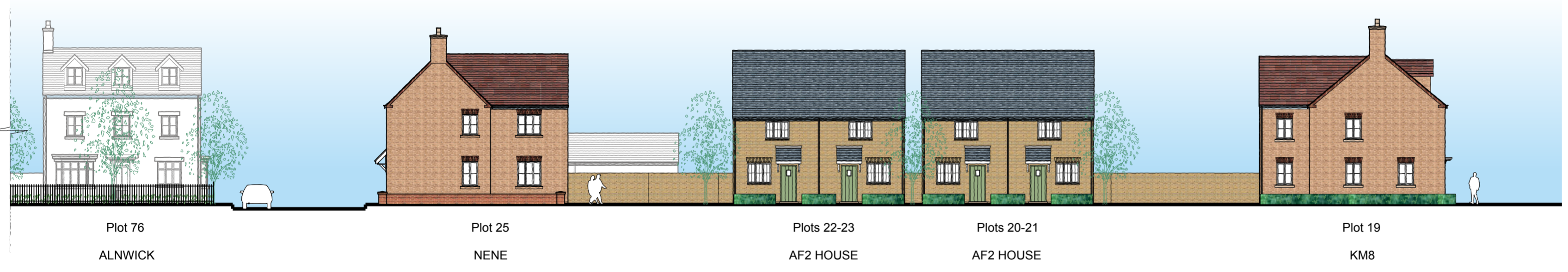
9 STREET SCENE C-C' - 2 Scale: 1:200