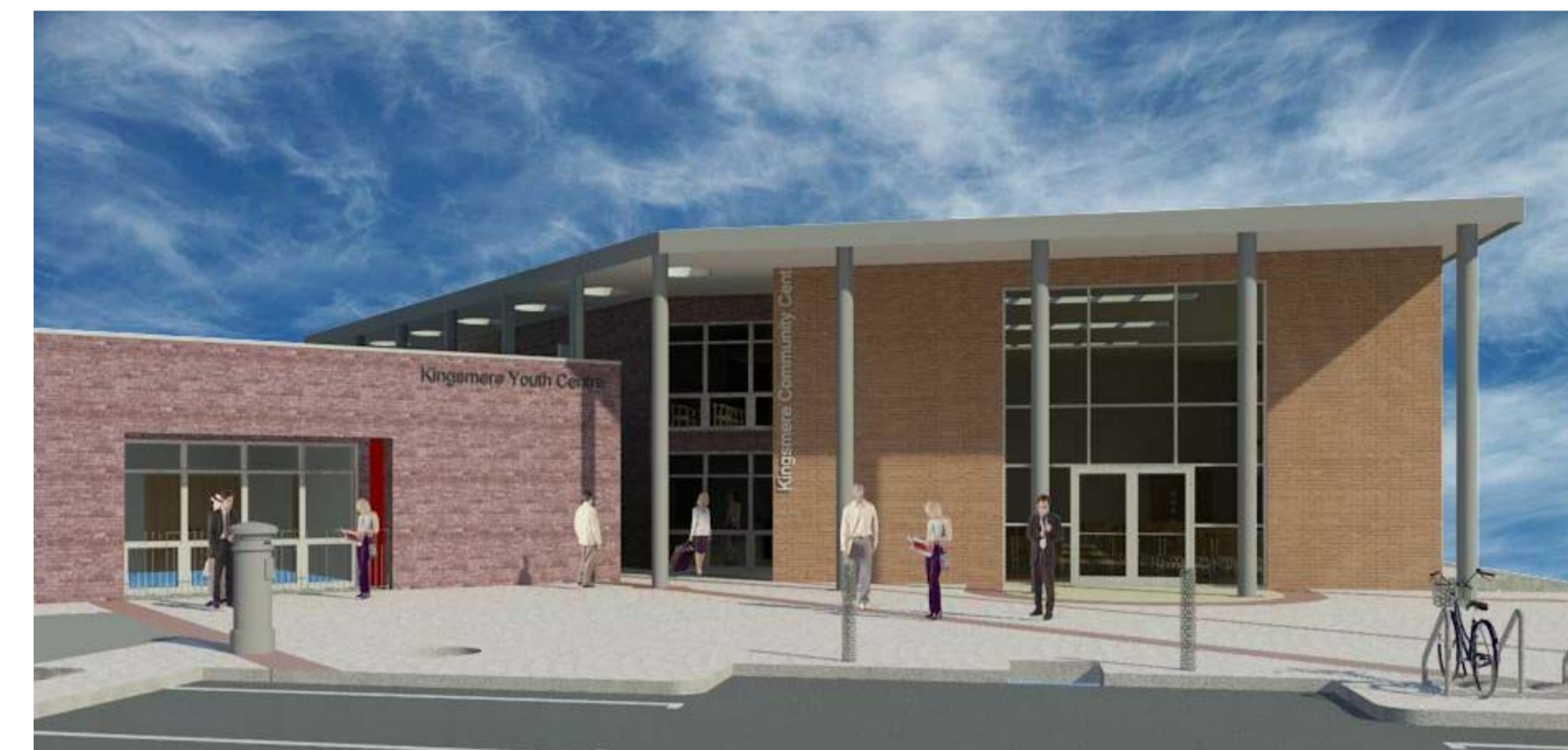
3 View of the community entrance 1 : 1