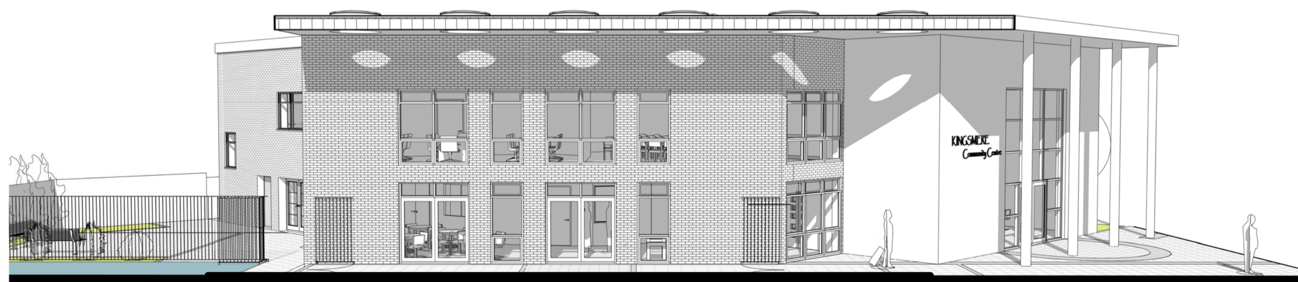
4 Section through entrance lobby