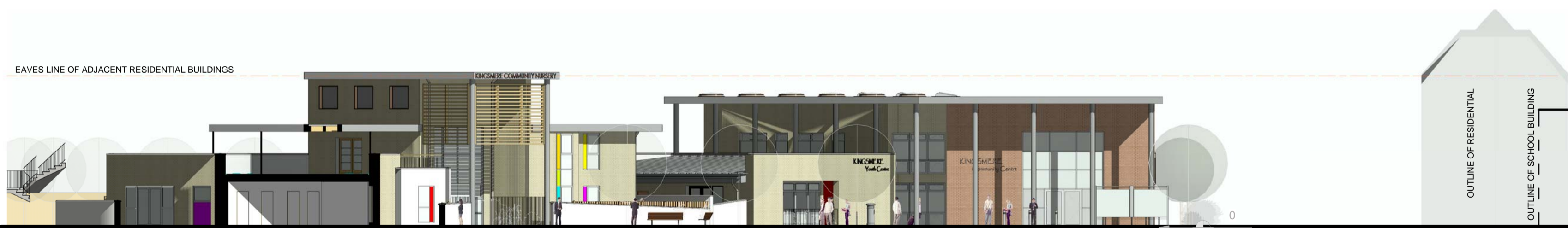
4 Section North South 1 : 200