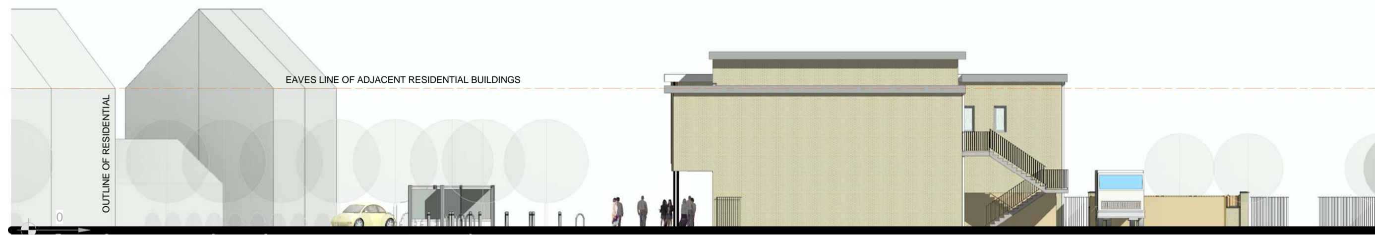
2 Section through public square 1 : 200