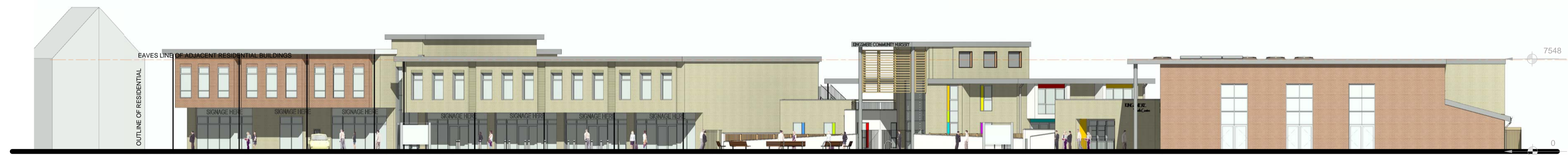
3 Section West to East 1 : 200