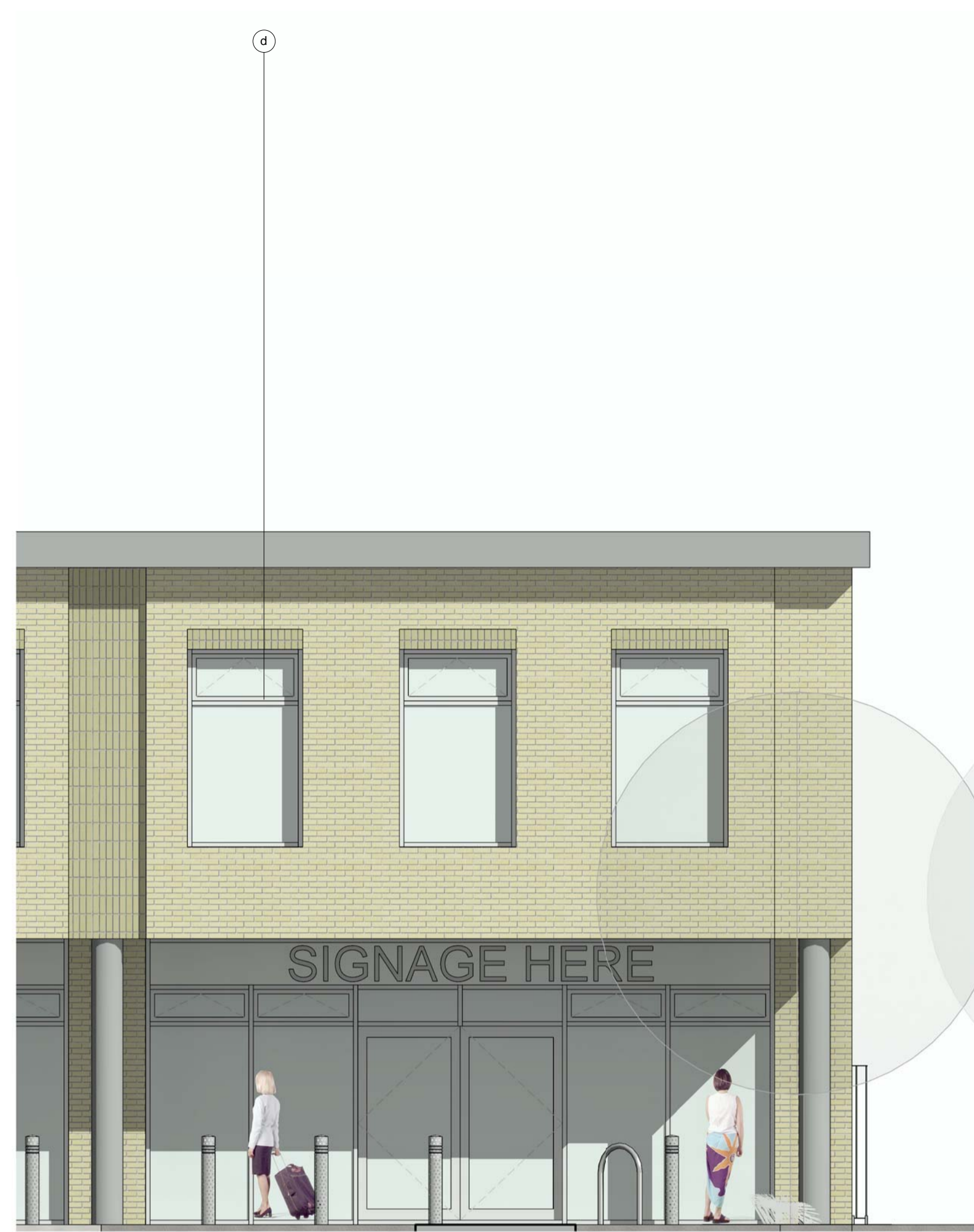
1 South West Elevation Detail 1 1 : 50