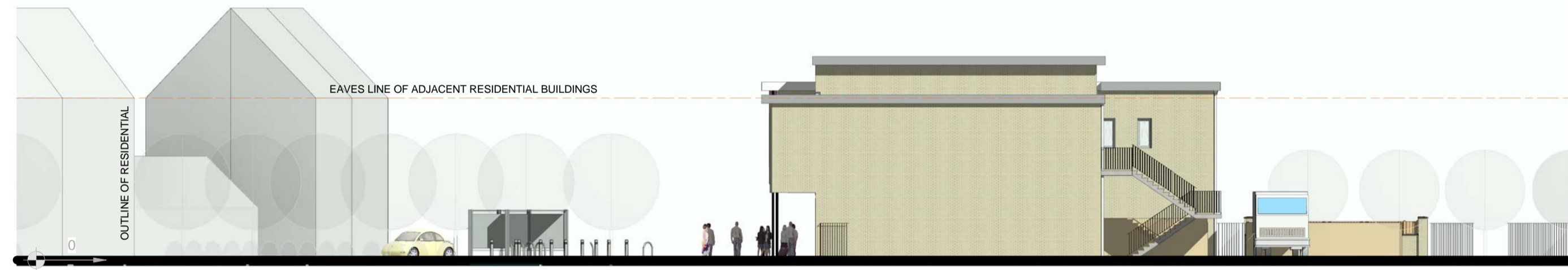
2 Section through public square 1 : 200