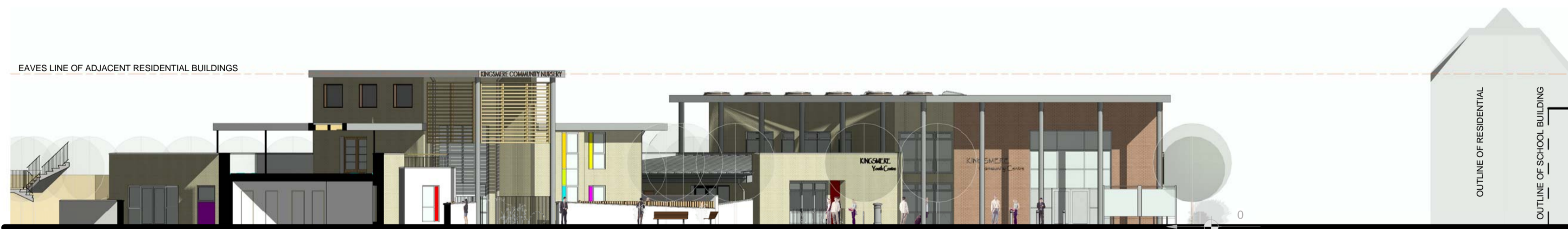
4 Section North South 1 : 200