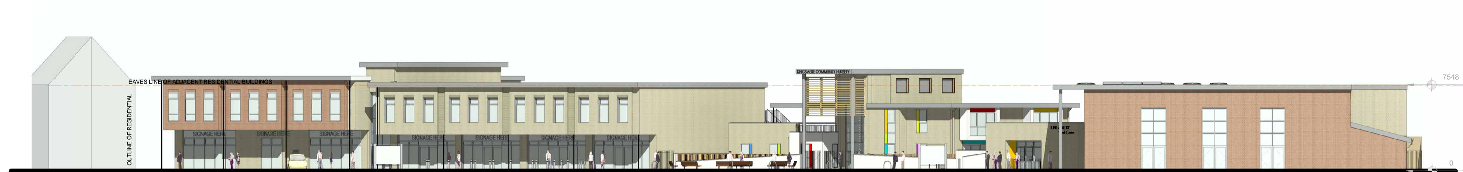
3 Section West to East 1 : 200