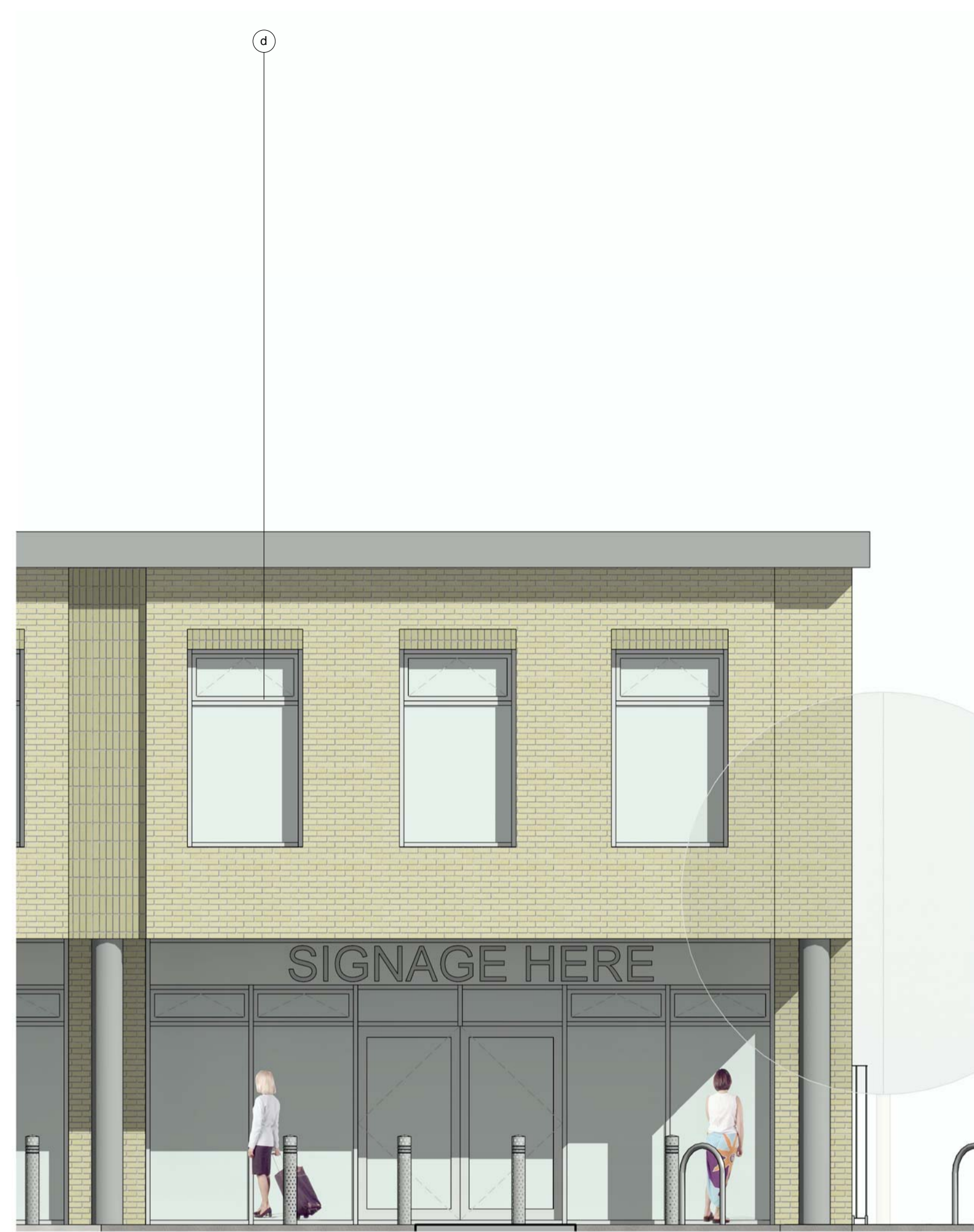
1 South West Elevation Detail 1 1 : 50