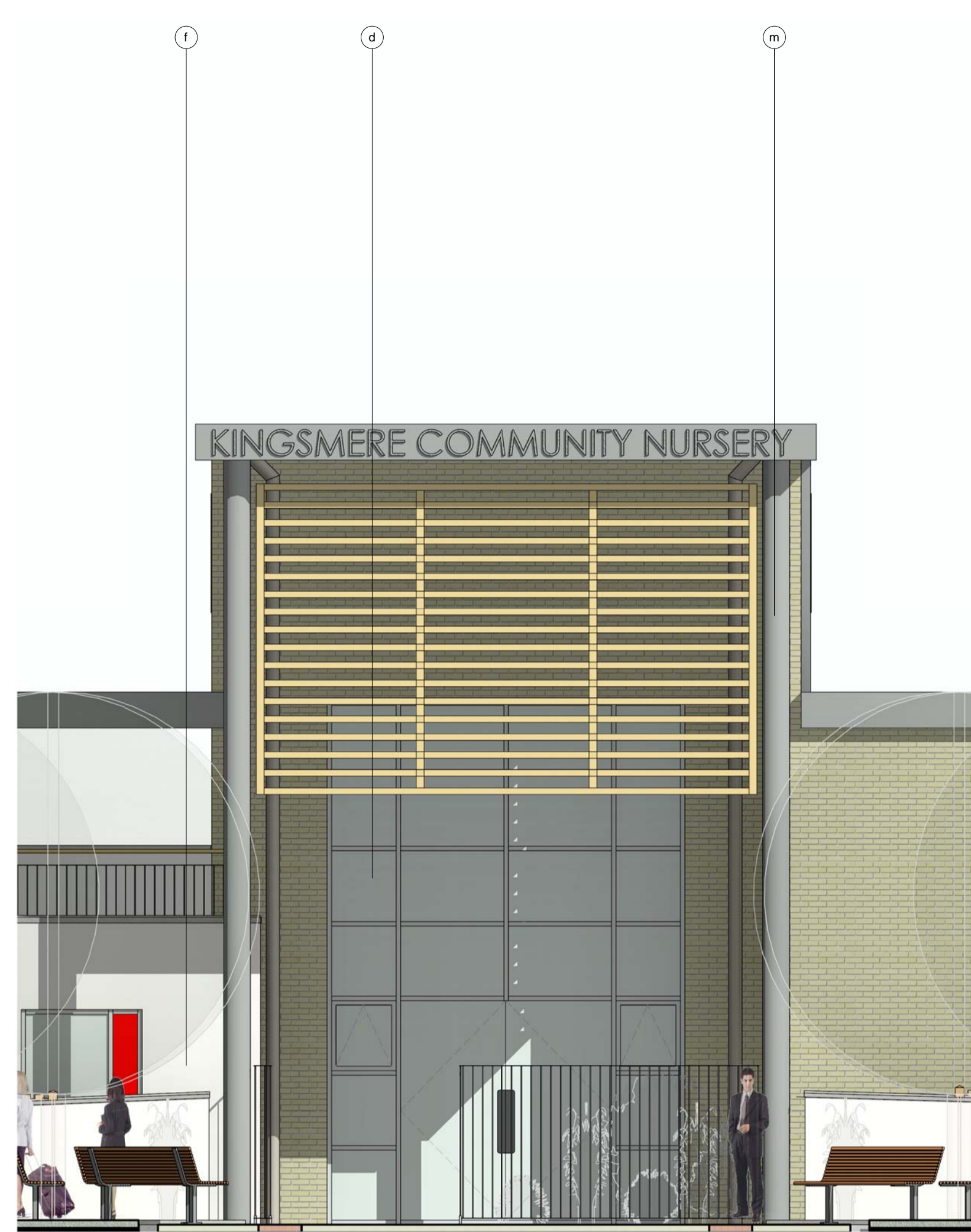
2 South West Elevation Detail 2 1 : 50