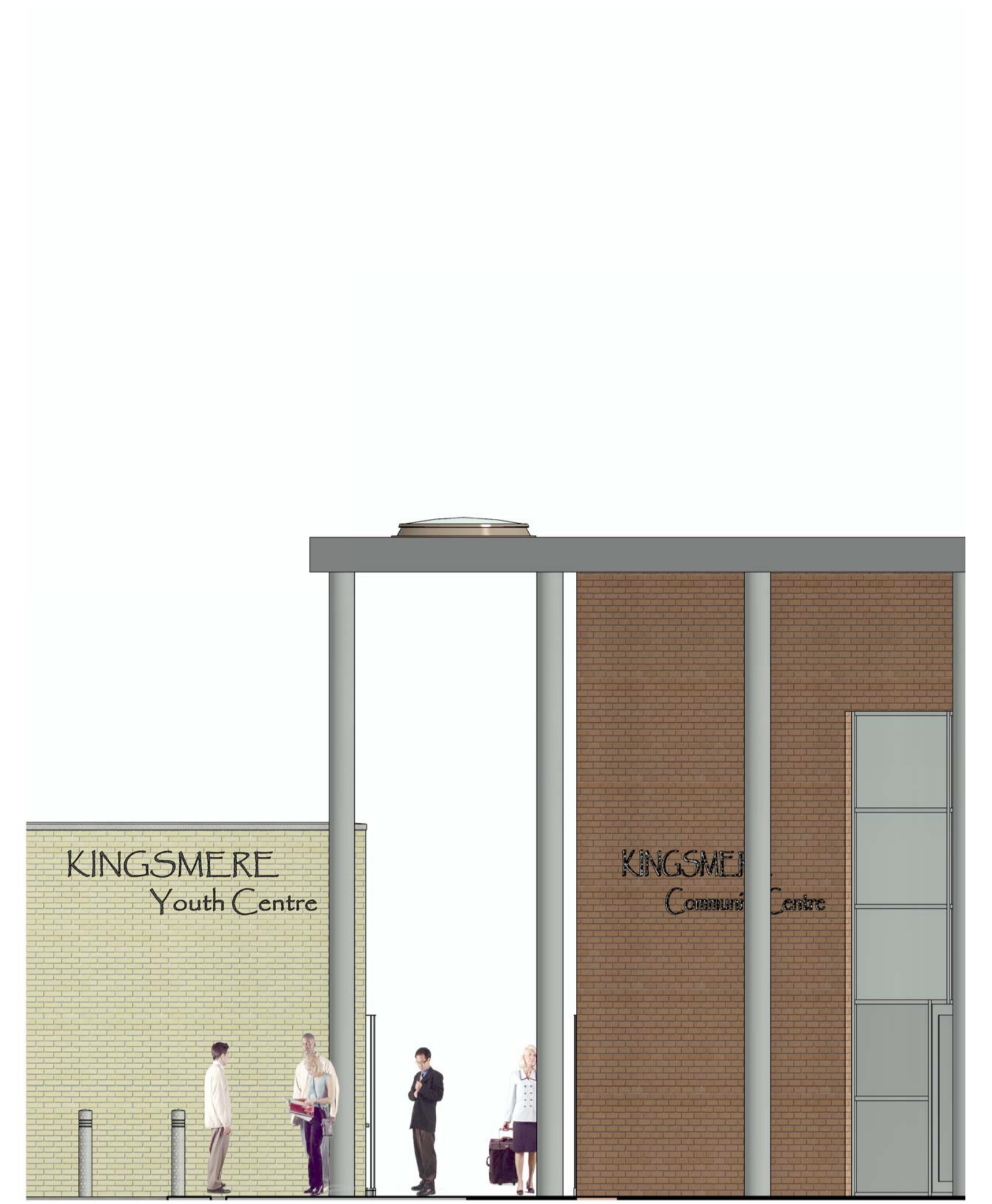
3 South West Elevation Detail 3 1 : 50