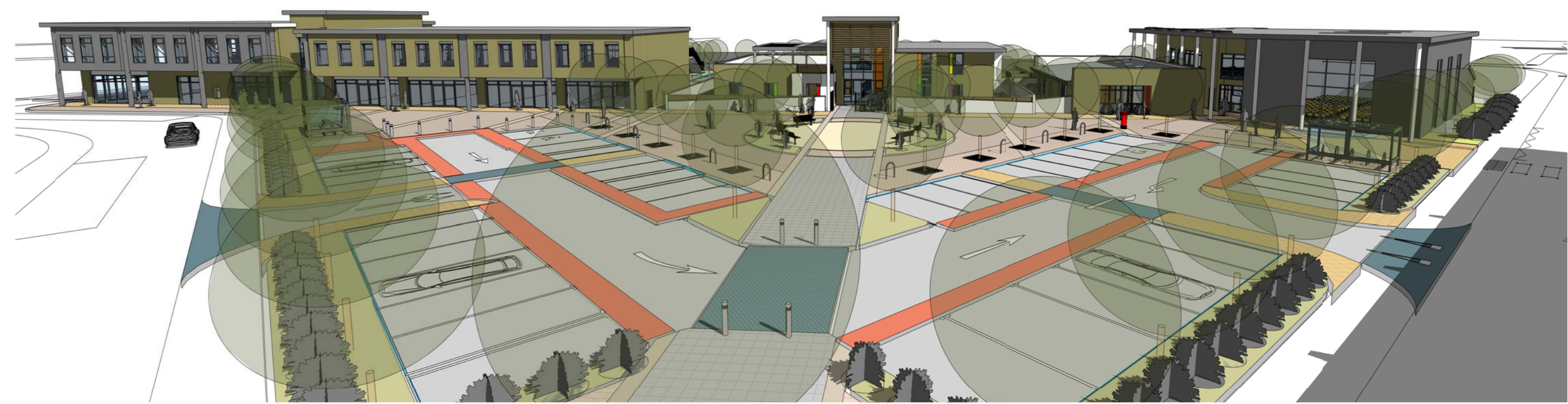
3 Aerial view from south west