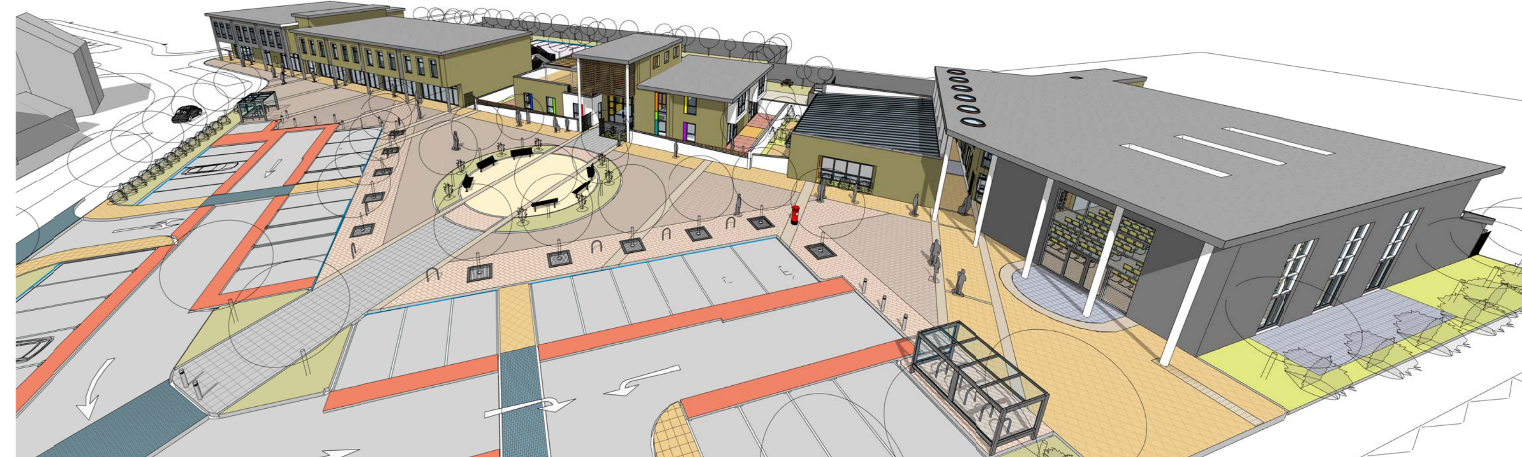
2 Aerial view from south