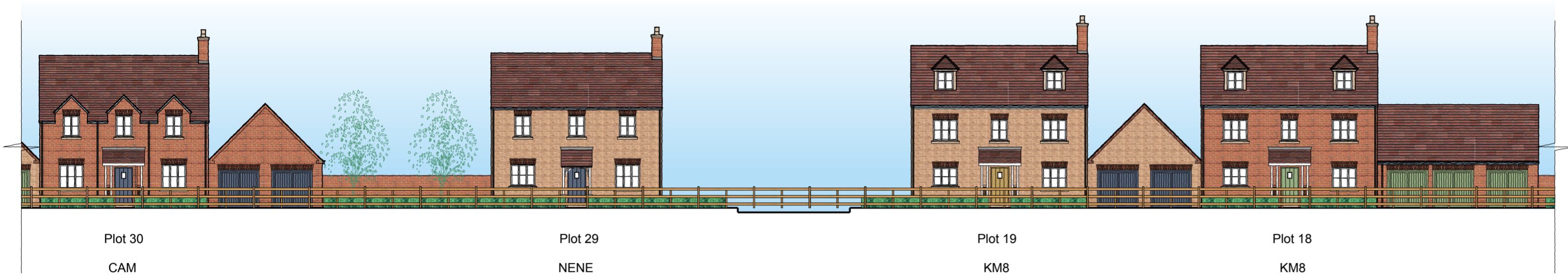
Plot 30 CAM Plot 29 NENE Plot 19 KM8 Plot 18 KM8