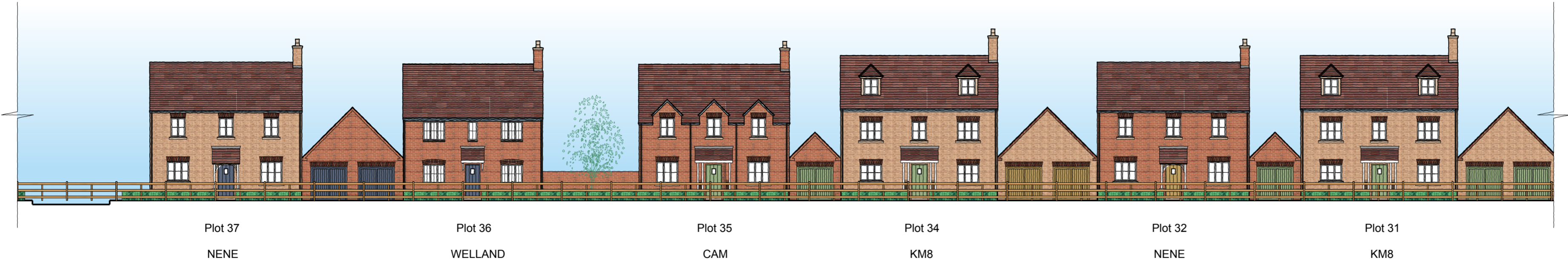
Plot 37 NENE Plot 36 WELLAND Plot 35 CAM Plot 34 KM8 Plot 32 NENE Plot 31 KM8

NOTES CONTRACTORS MUST VERIFY ALL DIMENSIONS ON SITE BEFORE COMMENCING ANY WORK ON SHOP DRAWINGS DO NOT SCALE FROM THIS DRAWING MCBAINS COOPER CONSULTING LTD COPYRIGHT