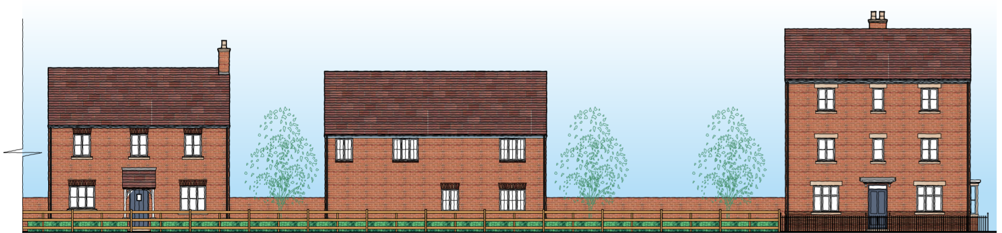
Plot 17 NENE Plot 1 OXFORD 2 Plot 2 KM6