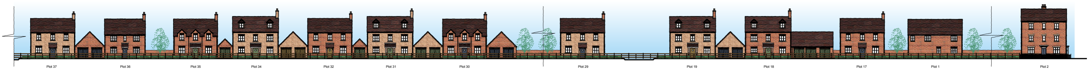
18 KEY STREET SCENE D-D' - 3 & 4 & 5 Scale: 1:500