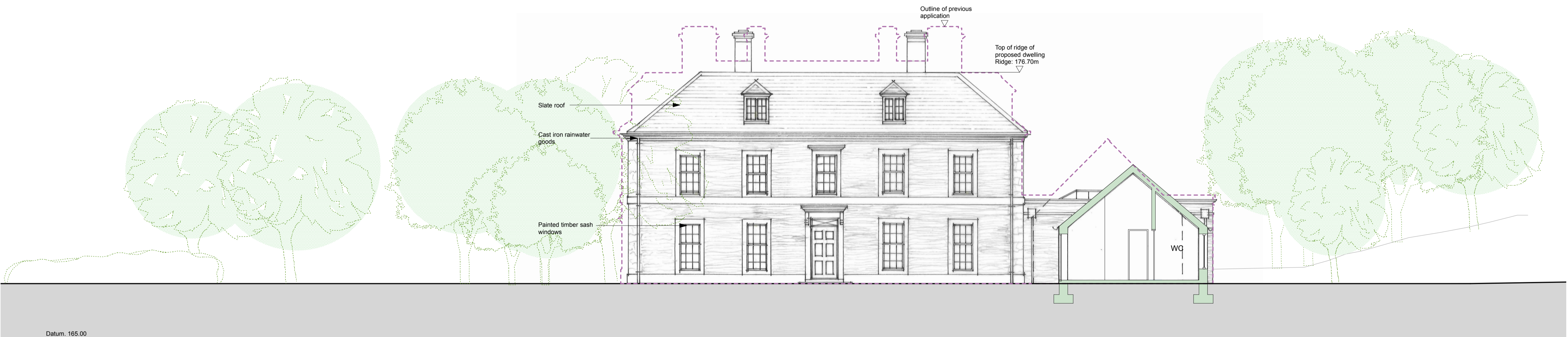
6: East Section and Elevation