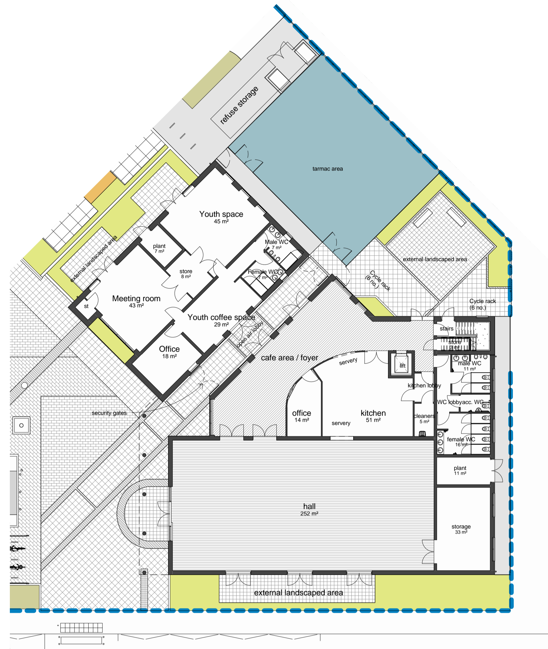
1 Ground Floor - Community centre 1 : 200