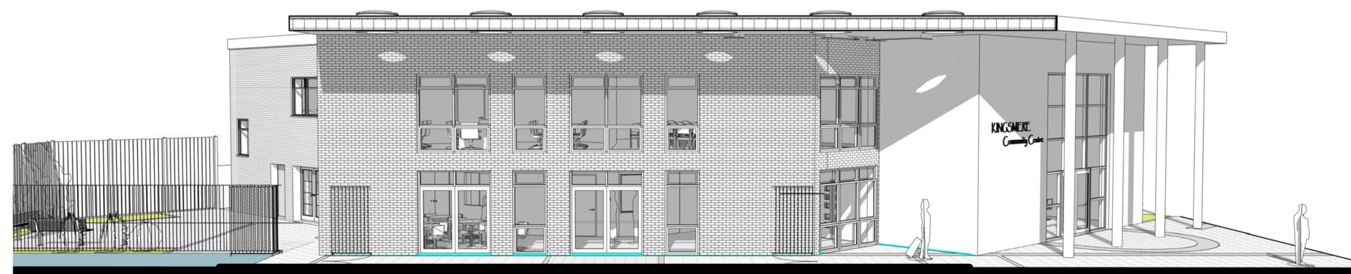
4 Section through entrance lobby