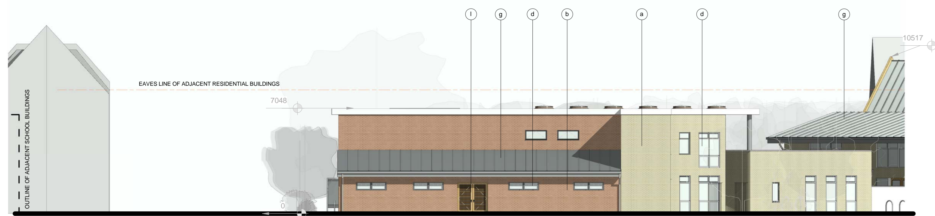
2 South East Elevation 1 : 150