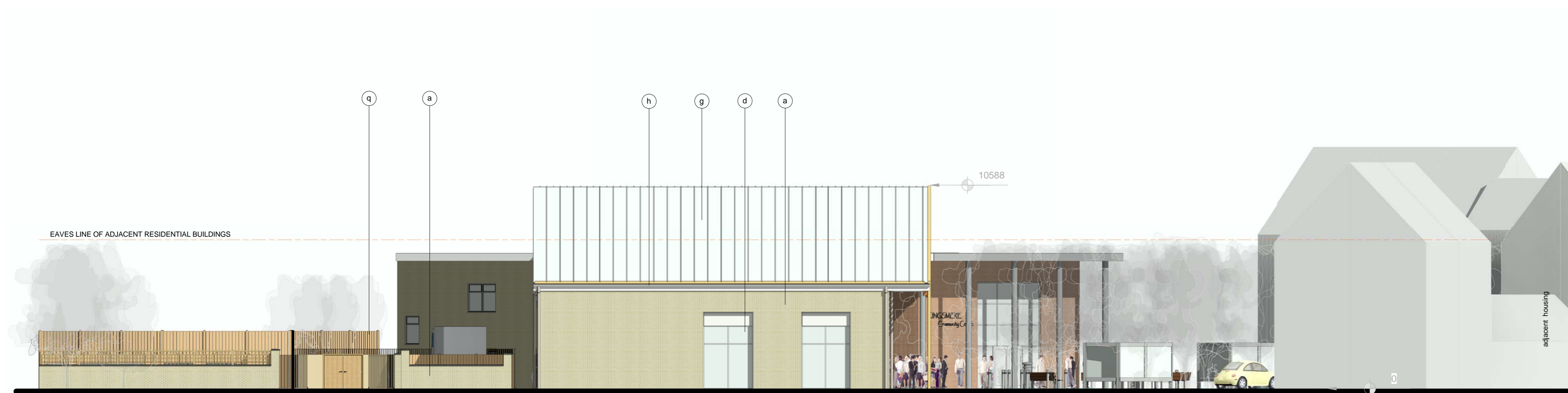
4 North West Elevation 1 : 150