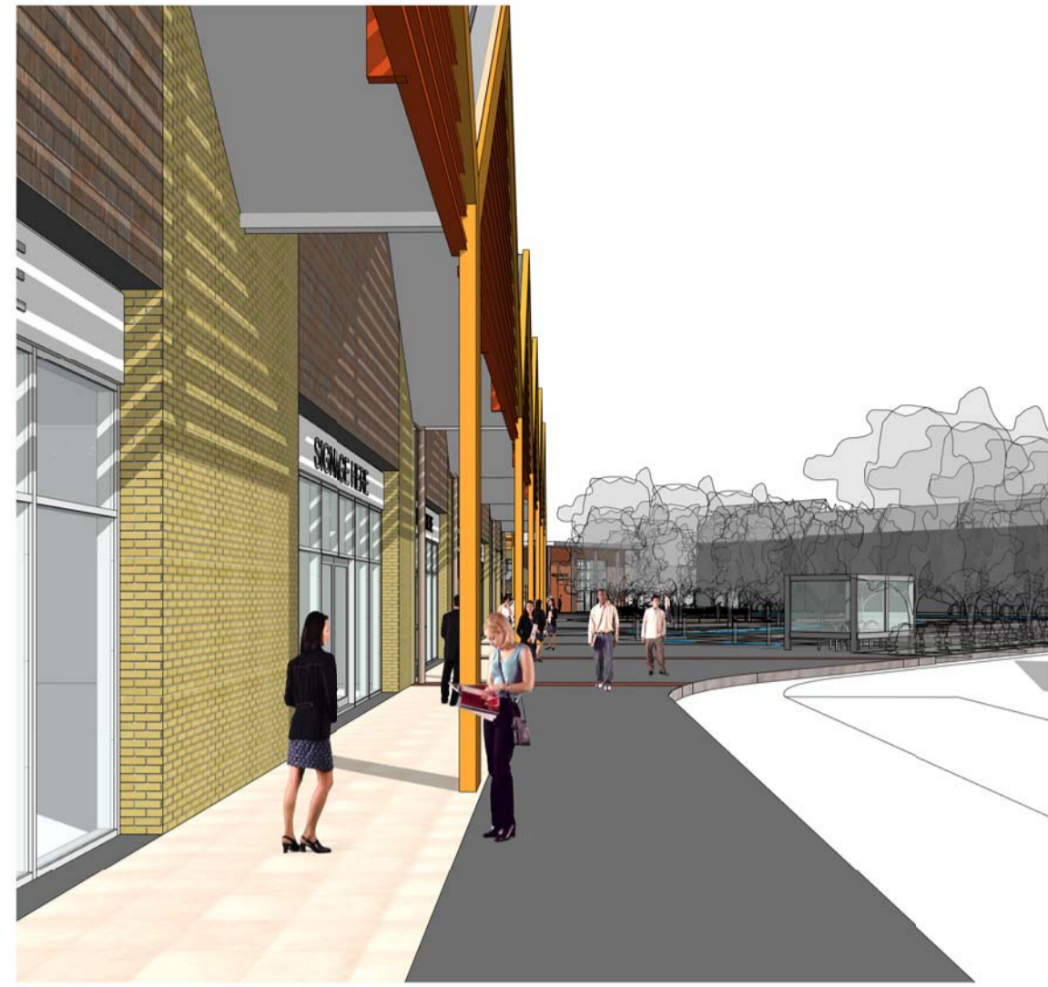
5 View of shop fronts