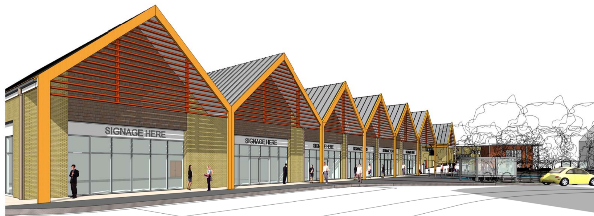
3 View from West