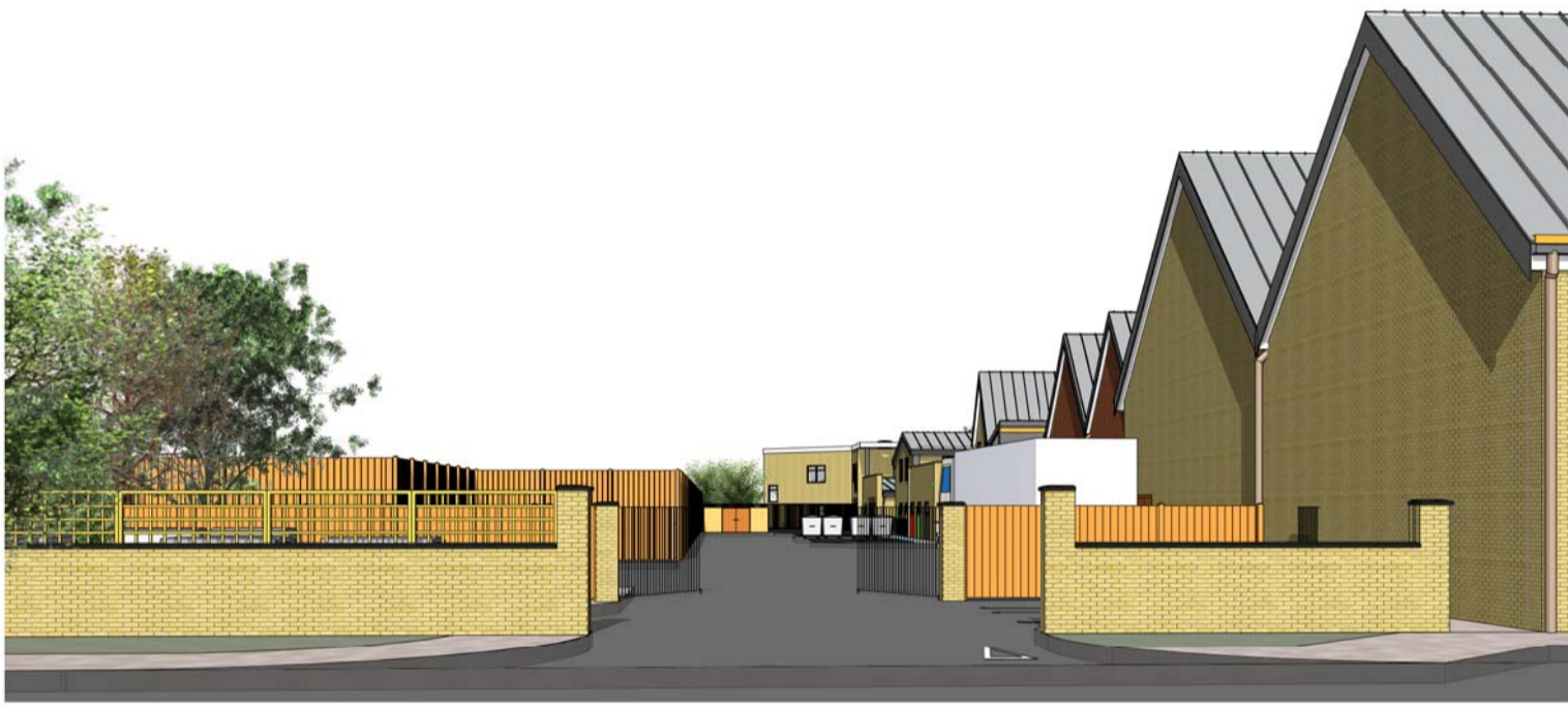
4 View of service yard