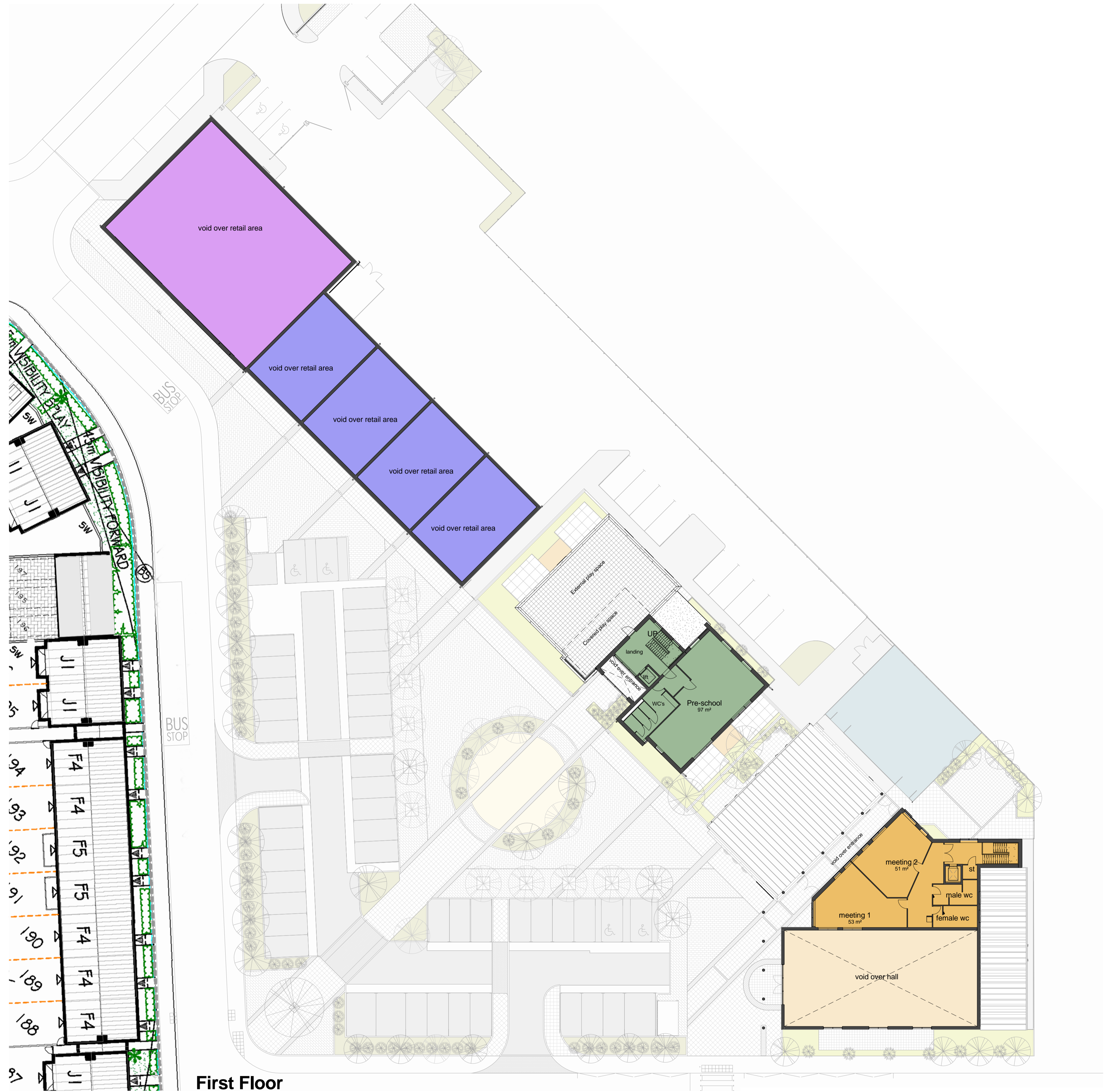
First Floor 1 : 250