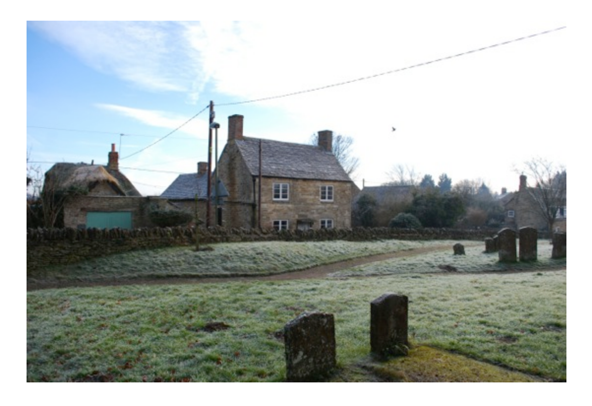
Chancel Cottage is one of the cottages that help to enclose the space.

From within the churchyard there are views out across to the house that illustrates this relationship.