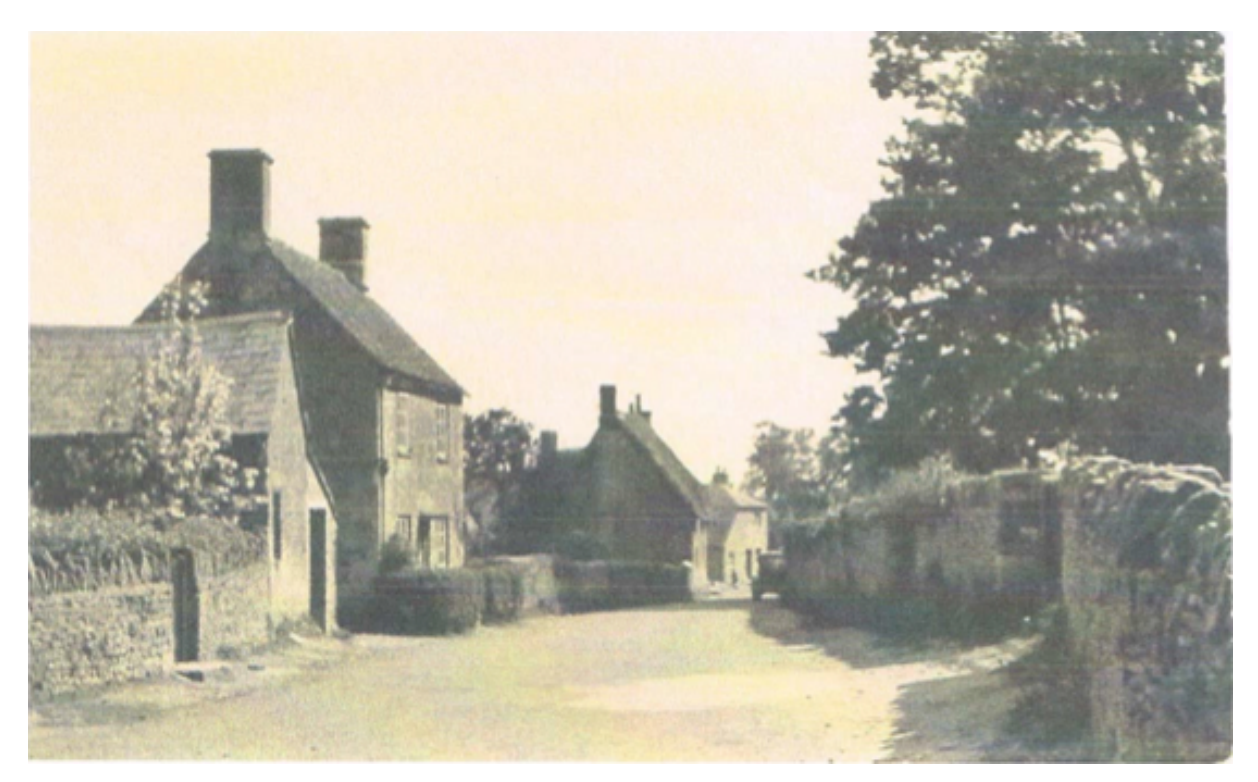
Early C20th photograph showing Chancel Cottage, with a large detached outbuilding in front of it.