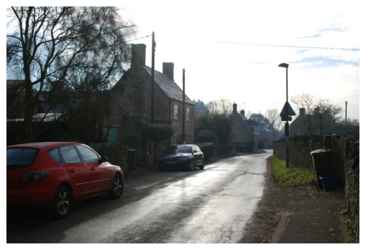
Note the difference in eaves detail from the photo above and also the loss of the outbuilding replaced with a flat roofed garage.