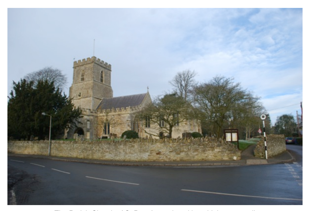
The Parish Church of St Peter's, enclosed by a high stone wall

The churchyard sits above the adjoin lanes, enclosed by a stone boundary wall and with footpaths leading up to the church doors. The churchyard imparts a sense of openness and greenery to that part of the village, its setting define by the houses and cottages that enclose the space on the opposite sides of the lanes