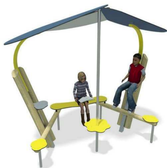
3 shelter Encounter 6 ref TE(ENCG)