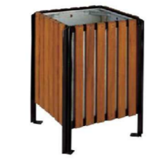
4 Iroka Woolbrook Litter bin

Benches and Litter Bins Orchard Street Furniture tel:- 01491 642123 email:- sales@orchardstreet.co.uk. www.orchardstreet.co.uk