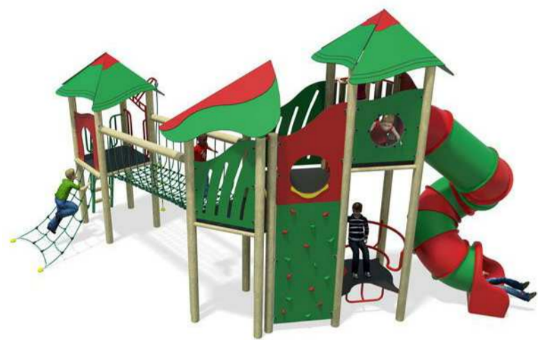
2 High Volume 7 Ref WT/L07