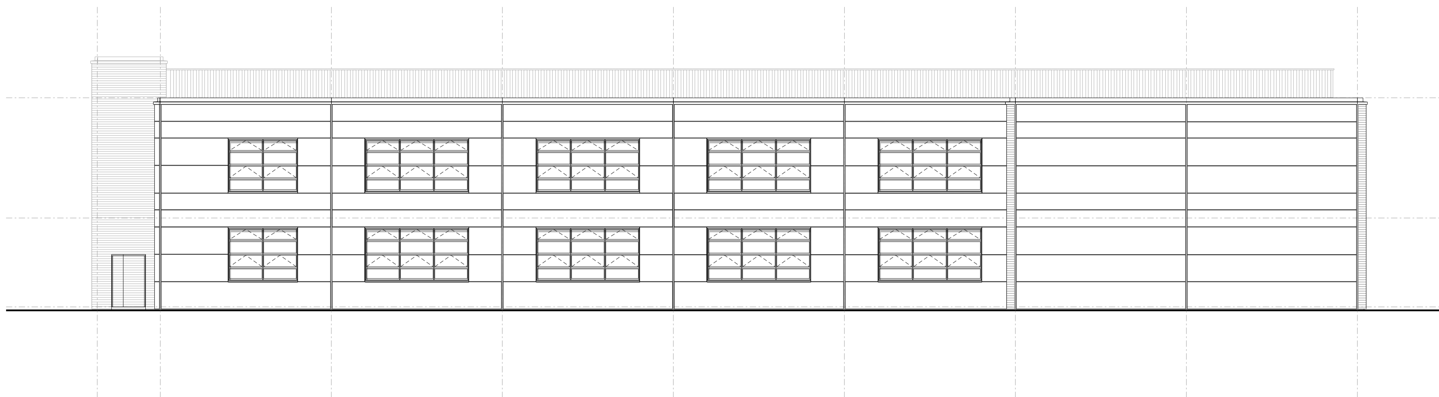
Existing West Elevation