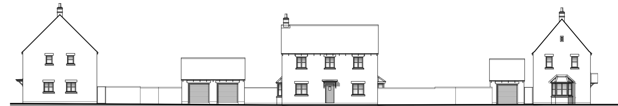
Plot 55 House Type K3 (4D1269) Street Scene 20 - Mews 2 Plot 56 House Type L1 (4D1371) Plot 48 House Type E1 (3D1041)