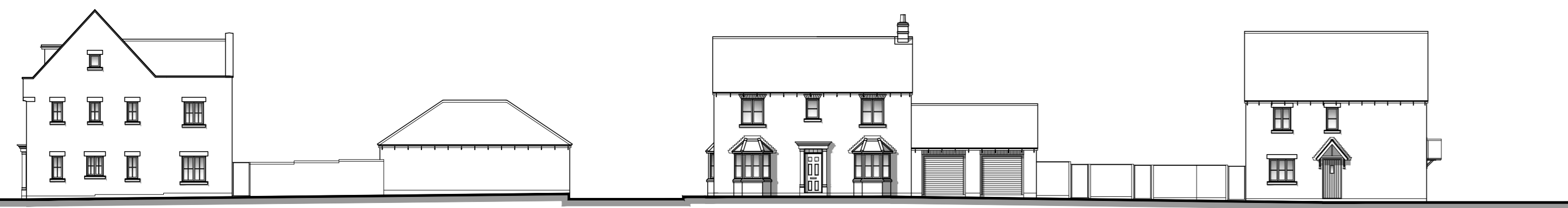
Plot 139 House Type V1 (502212) Street Scene 17 - Side Street 7 Plot 165 House Type N2 (4D1564) Plot 166 House Type AA1 (469564)