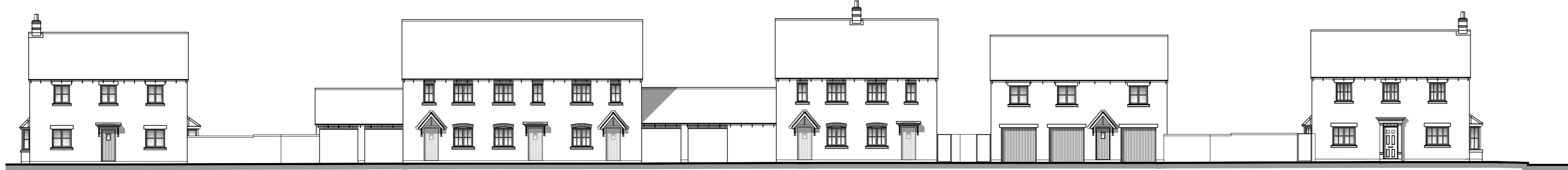
Plot 47 House Type L1 (4D1371) Street Scene 21 - Mews 2 Plot 57 House Type C1 (31855) Plot 58 House Type C3 (31855) Plot 59 House Type C1 (31855) Plot 60 House Type C1 (31855) Plot 61 House Type C2 (31855) Plot 62 House Type A1 (21768) Plot 63 House Type L2 (4D1371)