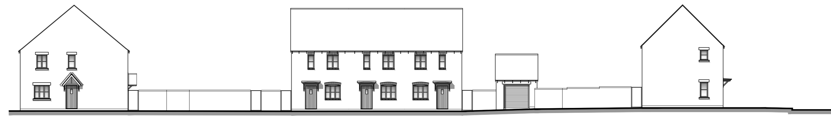
Plot 33 & 34 House Type AA1 (469564) Street Scene 18 - Mews 1 Plot 35 House Type EE5 (823) Plot 36 House Type EE1 (823) Plot 37 House Type EE5 (823) Plot 44 House Type K4 (4D1269)