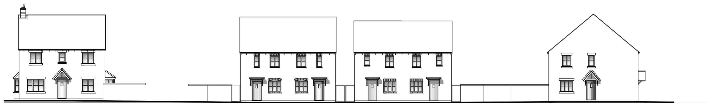
Plot 23 House Type E1 (3D1041) Street Scene 19 - Mews 1 Plot 38 House Type EE1 (823) Plot 39 House Type EE1 (823) Plot 40 House Type B1 (21734) Plot 41 House Type B1 (21734) Plot 42 & 43 House Type AA1 (469564)