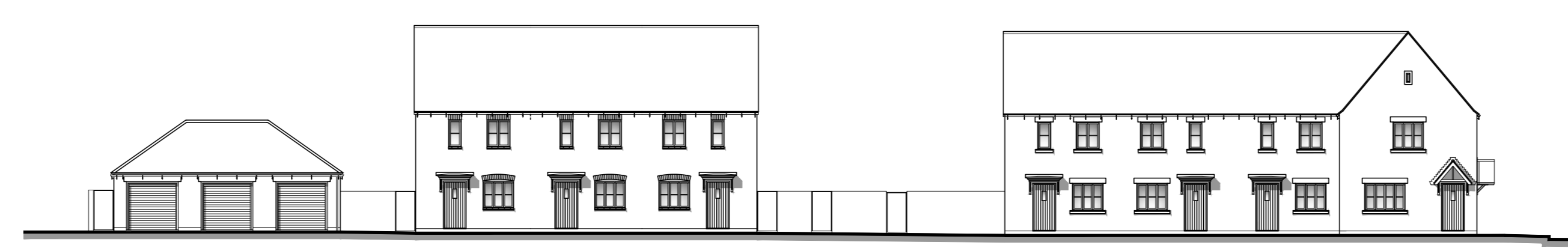
Plot 173 House Type EE5 (823) Street Scene 24 - Mews 4 Plot 174 House Type EE1 (823) Plot 175 House Type EE5 (823) Plot 176 House Type EE1 (823) Plot 177 House Type EE1 (823) Plots 178 & 179 House Type AA1 (469560)