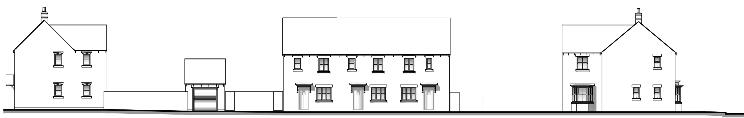
Plot 144 House Type Y2 (3D1119) Street Scene 23 - Mews 3 Plot 145 House Type B1 (21734) Plot 146 House Type B3 (21734) Plot 147 House Type B1 (21734) Plot 148 House Type N3 (4D1564)