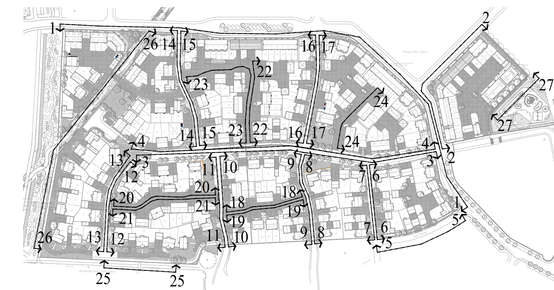
Layout Scale 1:2000