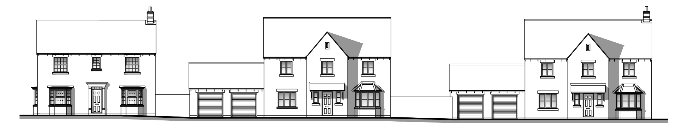
Plot 64 House Type N1 (4D1564) Street Scene 25 - Private Drive Plot 65 House Type S2 (5D1812) Plot 66 House Type S1 (5D1812)