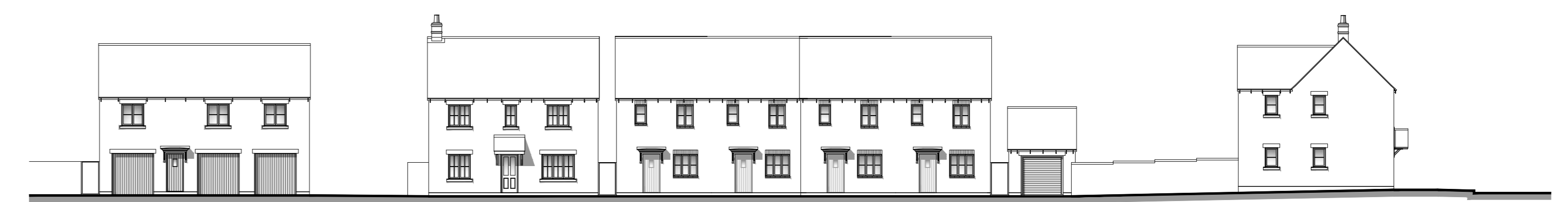
Plot 151 House Type A3 (21768) Street Scene 22 - Mews 3 Plot 152 House Type M1 (4D1359) Plot 153 House Type B3 (21734) Plot 154 House Type B3 (21734) Plot 155 House Type B3 (21734) Plot 156 House Type B3 (21734) Plot 157 House Type Y1 (3D1119)