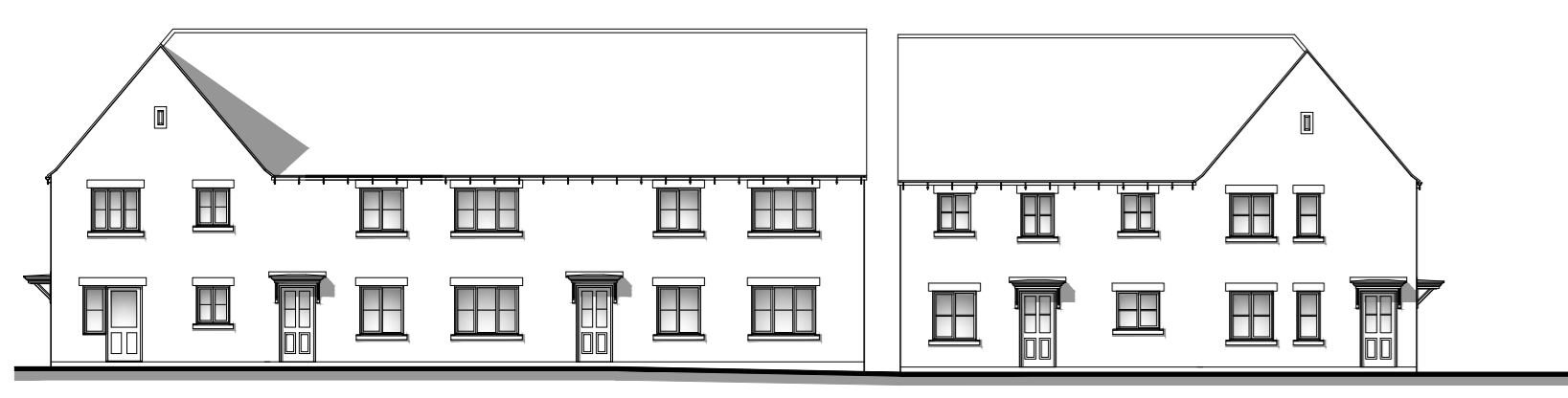
Plot 216 & 217 House Type AA2 (4695691) Street Scene 27 - Minor Street 2 Plot 218 & 219 House Type BB2 (560804) Plot 220 & 221 House Type BB2 (560804) Plot 222 & 223 House Type BB2 (560804) Plot 224 & 225 House Type AA2 (4695691)