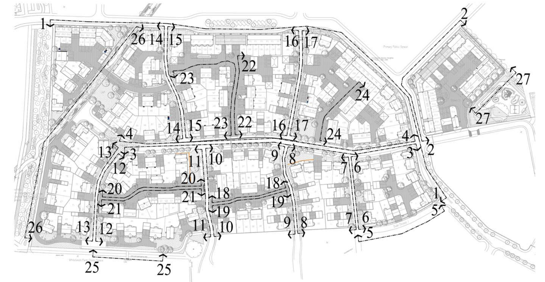
Layout Scale 1:2000