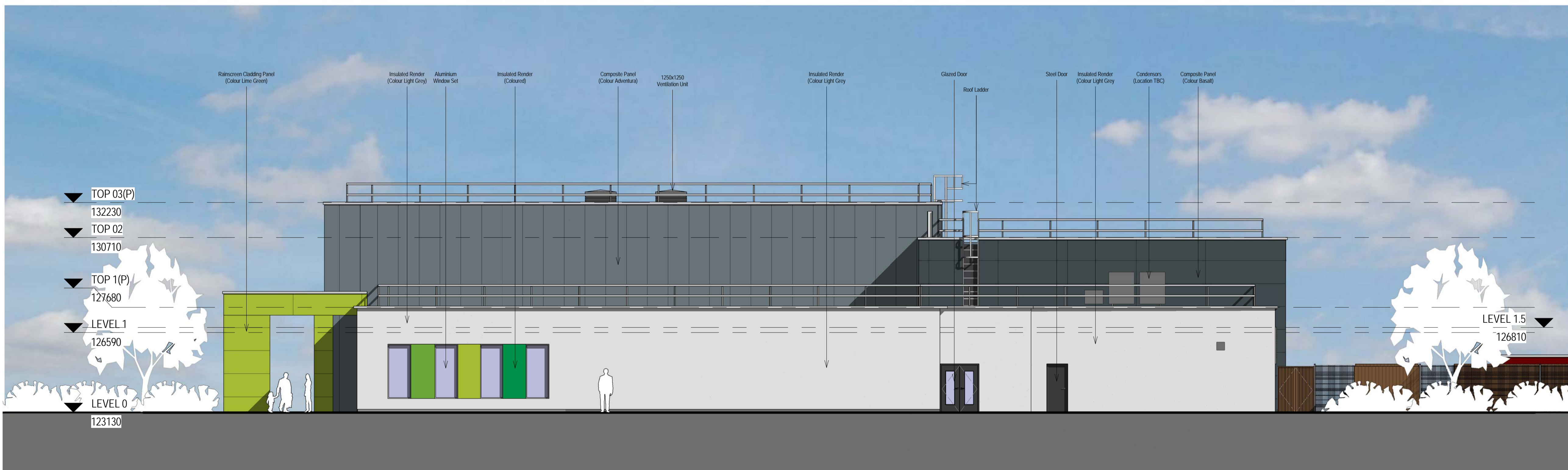
2 L-SH-2151 - West Elevation 1 : 100

Job Title Heyford Park Free School Sports Centre Drawing Title Elevations South and West