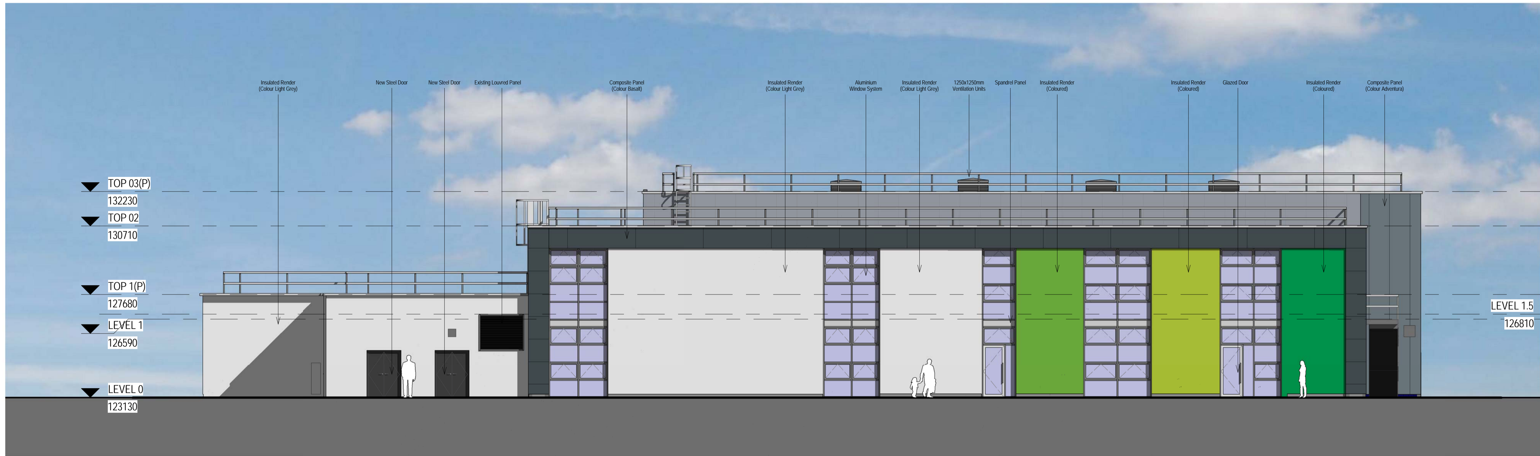
1 L-SH-2151 - South Elevation 1 : 100