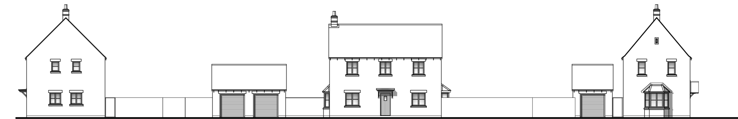
Plot 34 House Type K3 (401269) Plot 35 House Type L1 (401371) Plot 47 House Type E1 (301041) Street Scene 20 - Mews 2