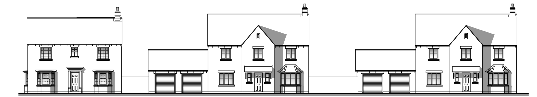
Plot 63 House Type N1 (401564) Plot 64 House Type S2 (501812) Plot 65 House Type S1 (501812) Street Scene 25 - Private Drive