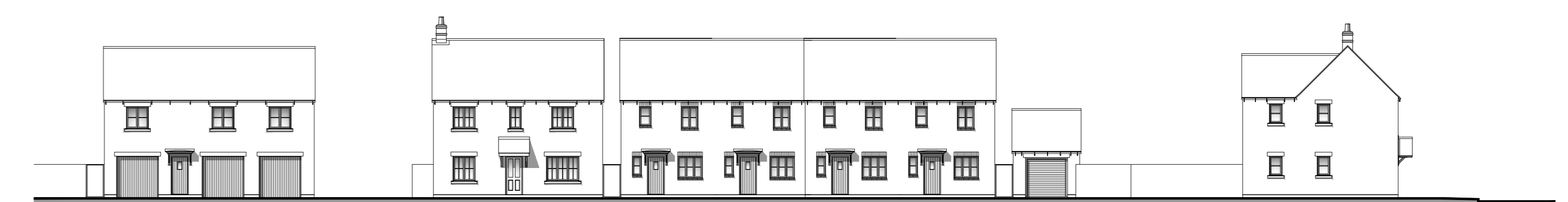
Plot 151 House Type A3 (21768) Plot 152 House Type M1 (401359) Plot 153 House Type B3 (21734) Plot 154 House Type B3 (21734) Plot 155 House Type B3 (21734) Plot 156 House Type B3 (21734) Plot 157 House Type Y1 (301119) Street Scene 22 - Mews 3