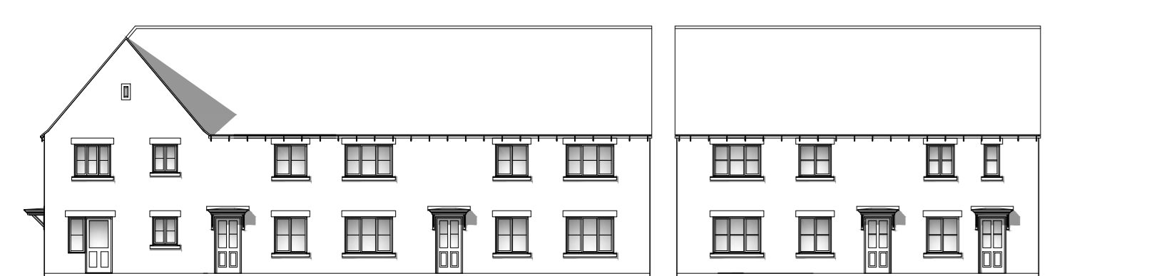
Plot 217 & 218 House Type AA2 (469/691) Plot 219 & 220 House Type BB2 (500/804) Plot 221 & 222 House Type BB2 (500/804) Plot 223 & 224 House Type BB2 (500/804) Plot 225 House Type EE6 (882) Street Scene 27 - Minor Street 2