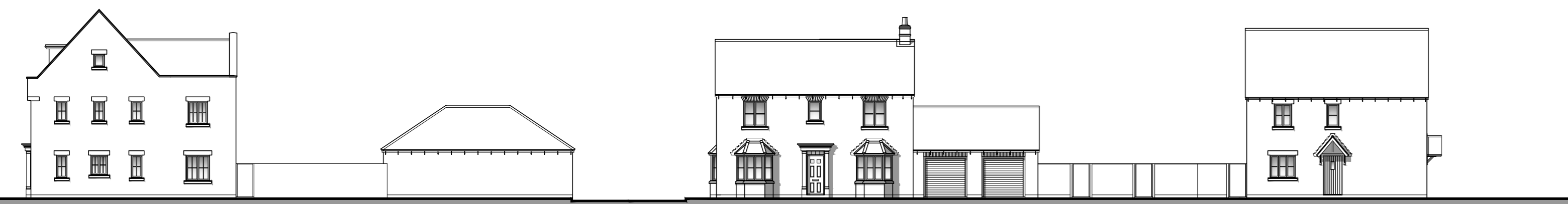
Plot 200 House Type V1 (502212) Street Scene 17 - Side Street 7