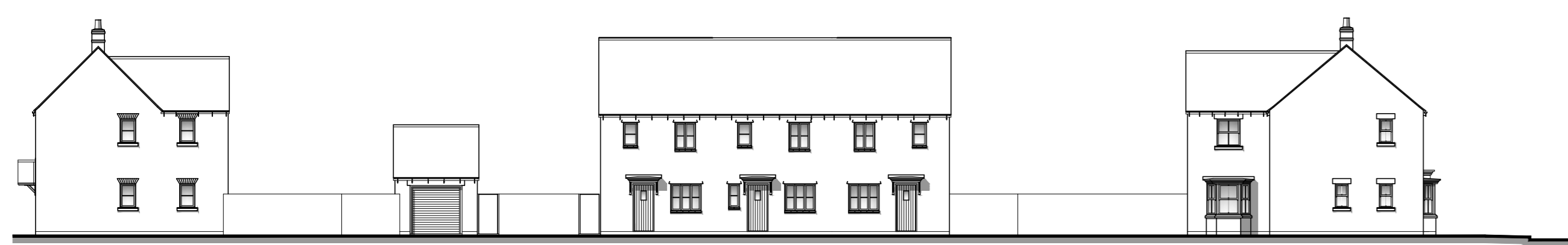
Plot 143 House Type Y2 (301119) Street Scene 23 - Mews 3