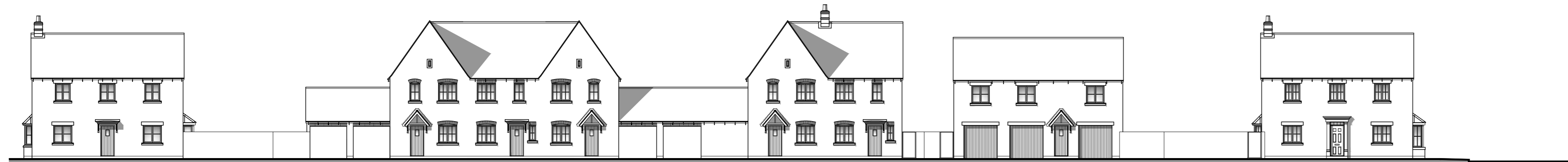
Plot 46 House Type L1 (401371) Street Scene 21 - Mews 2