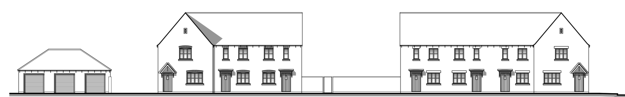
Plots 172 & 173 House Type AA1 (469/560) Plot 174 House Type EE1 (823) Plot 175 House Type EE5 (823) Plot 176 House Type EE5 (823) Plot 177 House Type EE1 (823) Plot 178 House Type EE1 (823) Plots 179 & 180 House Type AA1 (469/560) Street Scene 24 - Mews 4