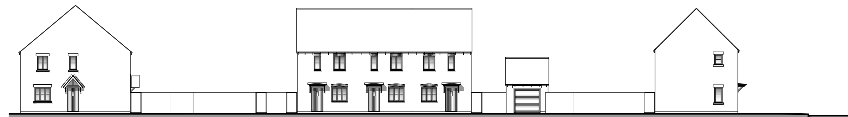
Plot 32 & 33 House Type AA1 (469/564) Plot 34 House Type EE5 (823) Plot 35 House Type EE1 (823) Plot 36 House Type EE5 (823) Street Scene 18 - Mews 1