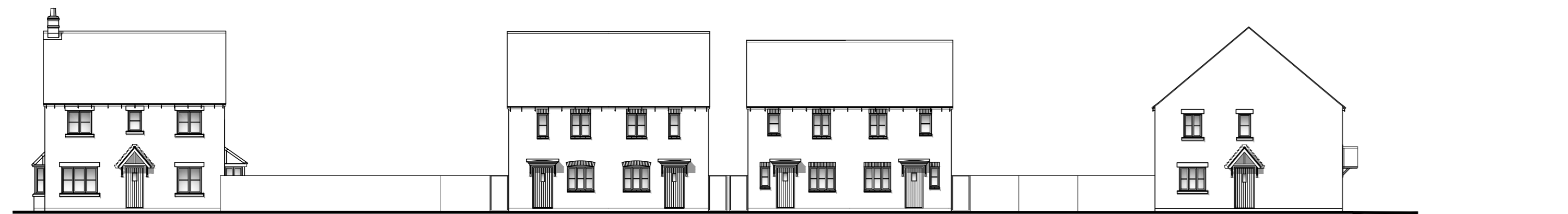
Plot 23 House Type E1 (301041) Street Scene 19 - Mews 1