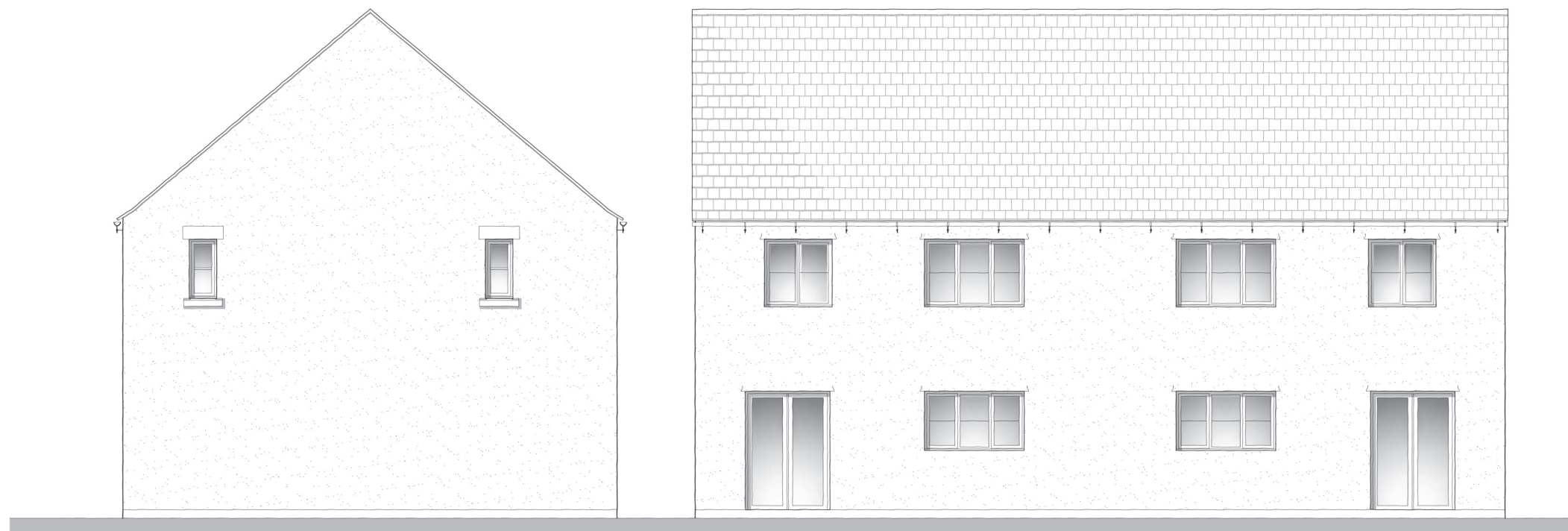
SIDE ELEVATION House Type HH2 (opp)