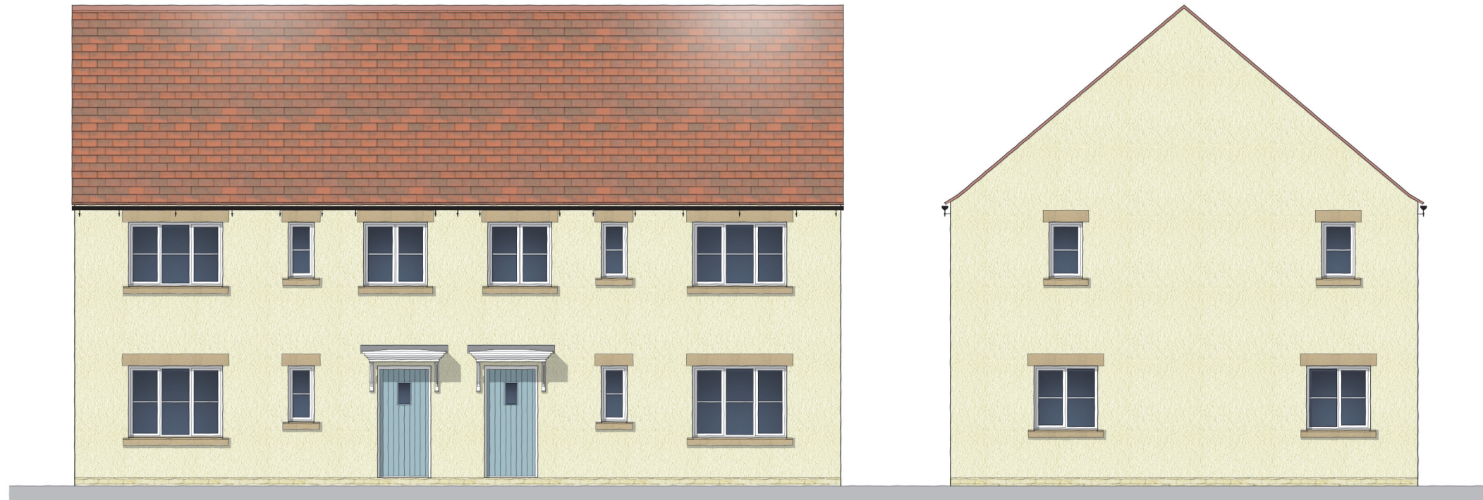
FRONT ELEVATION House Type HH1 (as) House Type HH2 (opp) Note: All windows to front elevation to be clear glazed

Rev Date Init A 19/11/14 AL Front gables removed, roof design changed. Floor area updated. - as client instruction