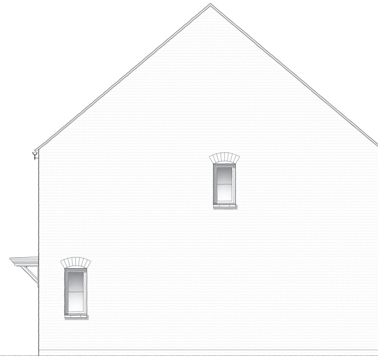
SIDE ELEVATION House Type EE5 (opp)