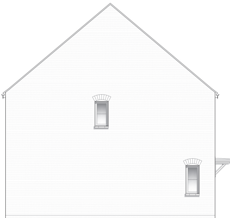
SIDE ELEVATION House Type EE5 (as)