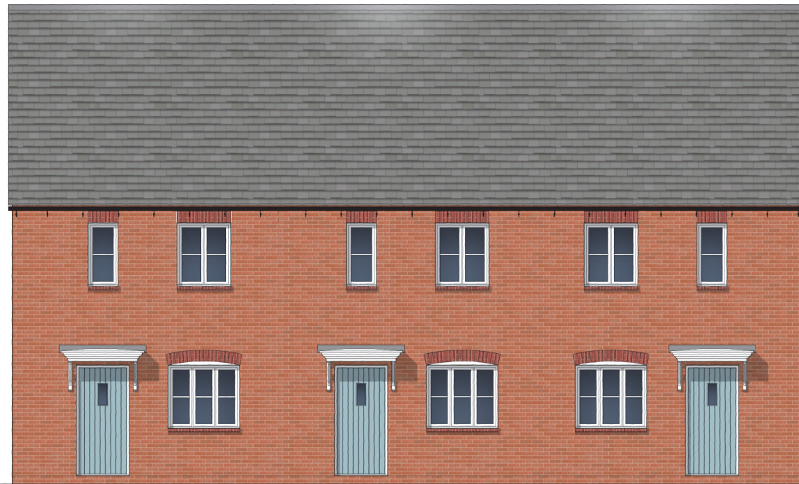
FRONT ELEVATION House Type EE5 (as)

Rev Date Init A 12/11/14 PK Brick verge and detail removed, Brick soldier heads added to windows. - as client instruction