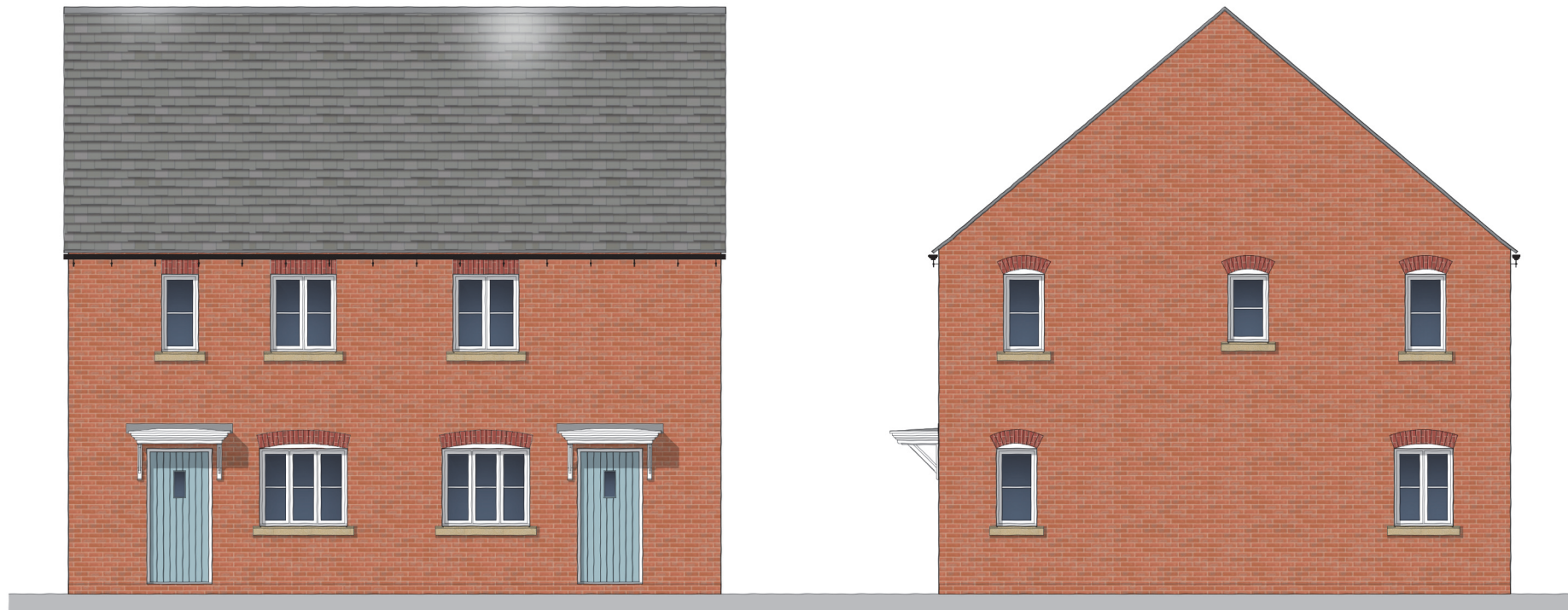
FRONT ELEVATION House Type EE1 (as)

Rev Date Init A 18/11/14 AL Roof modified to gable end, upper brick bands removed, brick window heads added