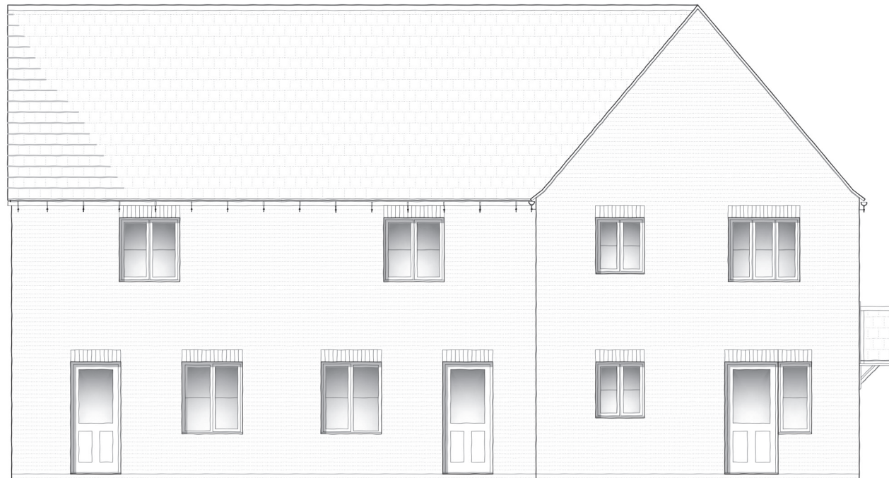
REAR ELEVATION House Type EE5 (opp)