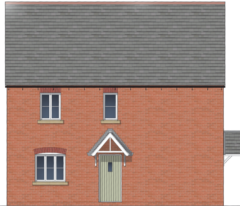
SIDE ELEVATION House Type AA1

Rev Date Init A 12/11/14 TE Ground & first floor plans replanned to omit porch extension from front elevation. Roof span direction amended. - as planners comments