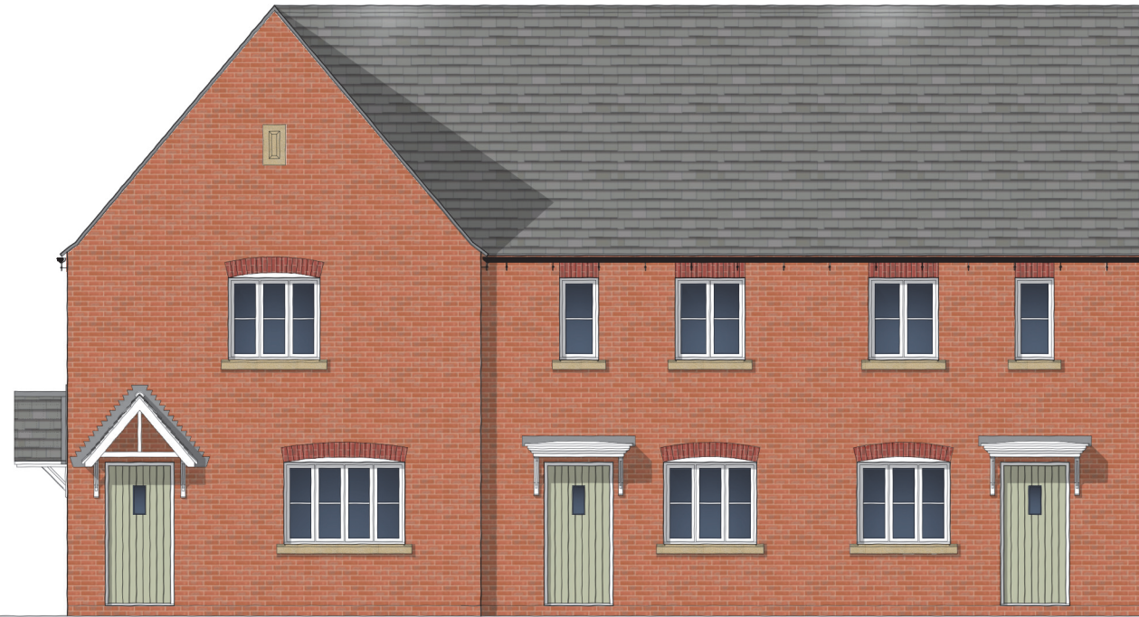
FRONT ELEVATION House Type AA1