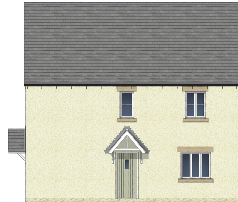
SIDE ELEVATION House Type AA1 (opp) Plot 179 & 180