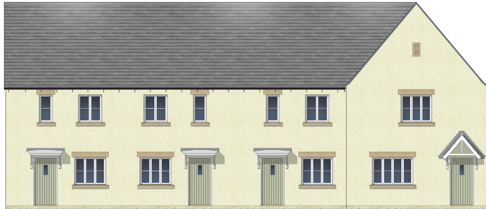
FRONT ELEVATION Flat Type EE5 (as) Plot 176

Rev Date Init A 12/11/14 TE Ground & first floor plans replanned to omit porch extension from front elevation. Roof span direction amended. - as planners comments