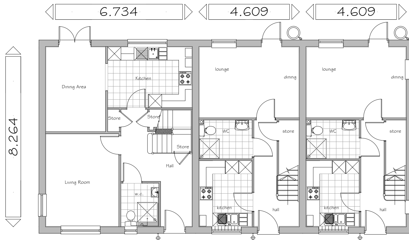
GROUND FLOOR PLAN House Type HH2 (as)